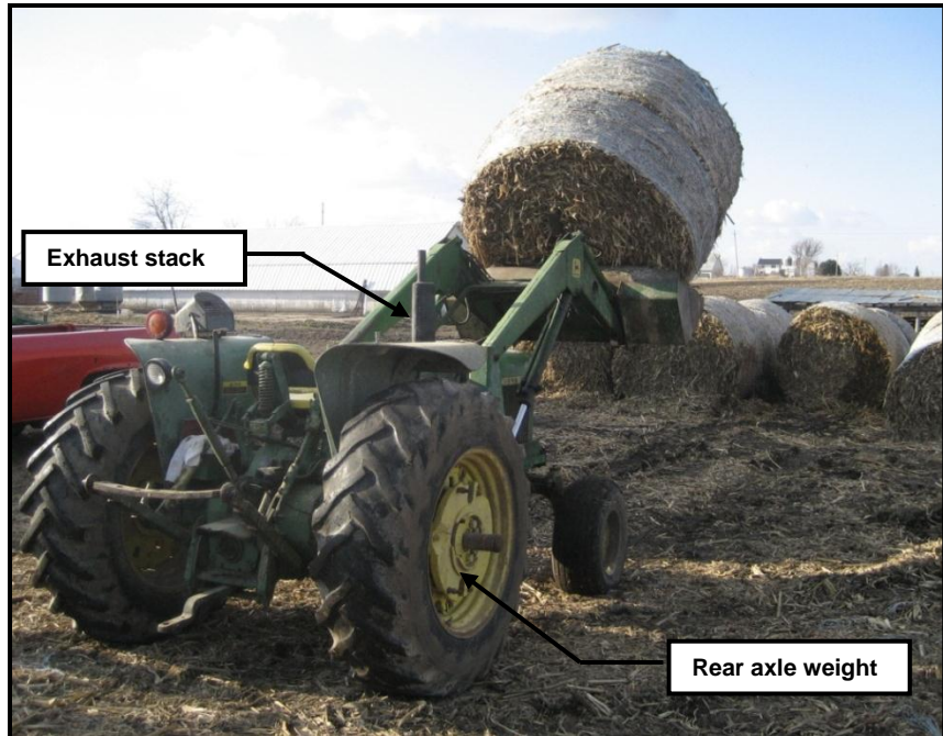
Photo 2 – Re-enactment showing the equipment involved and the orientation and approximate height of the raised bale before the incident. Note the arrangement of remaining bales illustrating how they were stored.

The cause of death was suffocation resulting from mechanical asphyxia.