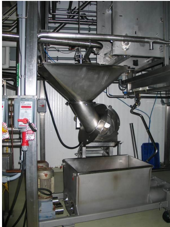
Figure 2 – The feed pump skid augers and lid