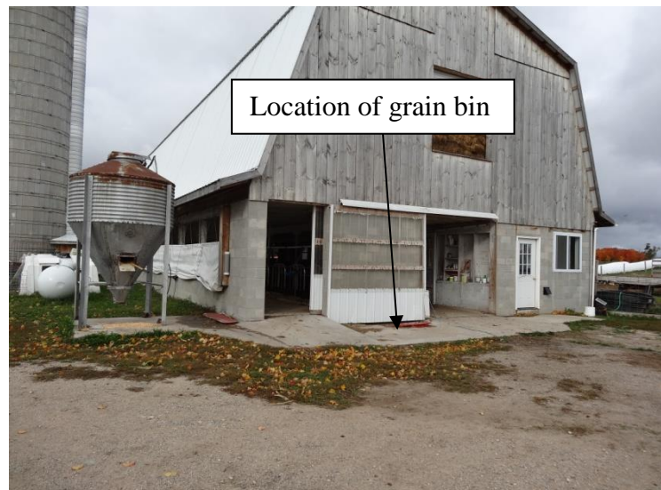
Figure 2. View of barn looking west

In fall 2014, a male dairy farmer died when he was crushed by a freestanding grain bin holding approximately six tons of grain, which fell after being struck by a horse and/or manure spreader. MIFACE learned about this incident from a newspaper clipping. The MIFACE researcher contacted the county’s MSU Extension agent, who contacted the family of the deceased. One of the decedent’s family members agreed to be interviewed by the MIFACE researcher. The MSU Extension agent accompanied the MIFACE researcher to the family member’s home. The family member accompanied the MIFACE researcher and MSU Extension agent to the decedent’s farm. During the writing of this report, the death certificate, police and medical examiner reports, and the MIOSHA compliance file were