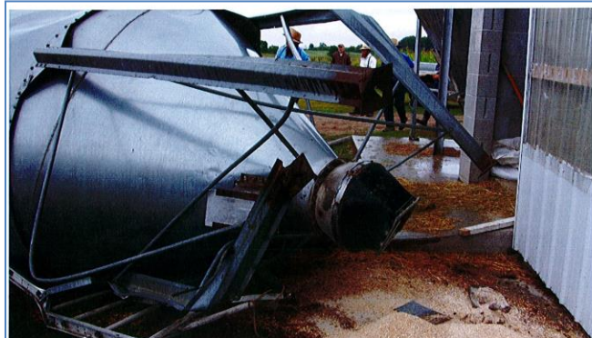
Figure 5. Overturned grain bin

All grain bins should be anchored to the ground to minimize overturn caused by high winds or other outside forces, such as being struck by machinery or, as in this case, a horse and/or manure spreader. It is important to anchor every leg of a hopper bottom bin. To do so, when the bin is placed on a concrete pad, use a leg anchor or similar mechanism for each leg. Leg anchors attach to the bin leg and have anchor bolts drilled into the concrete pad to provide stability. If the bin is not on a concrete pad, clear away any gravel or rock, and use a tie down/anchoring system that is installed in firm soil.