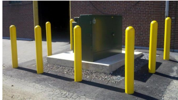
Figure 6. Example of bollard use.

MIFACE recommends that farm operations identify “lanes of travel” and install barriers to protect vital assets, such as buildings, storage units, etc. from damage. One low cost method of barrier protection is a bollard, which is a sturdy, short, vertical steel post that creates a protective perimeter to what is being protected (See Figure 6).