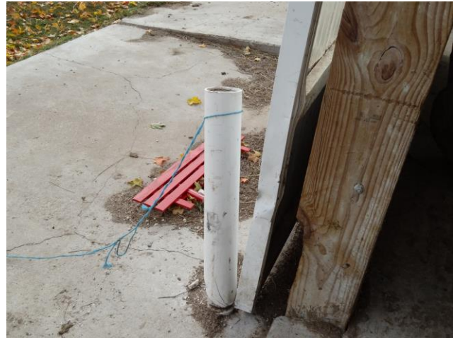
Figure 4. Damaged barn frame and bumper post

For reasons unknown, while the decedent was shoveling the second load of manure into the spreader, something startled one or both of the horses. The family member hypothesized that something specifically startled the younger horse. Both horses bolted of the barn. The young horse pulled to the right (south) causing damage to the barn frame and the bumper post next to the barn access (See Figure 4). Both damage sites had manure on them. Both horses and the trailing manure spreader continued to run south around the concrete pad with the unsecured grain bin. It is unclear whether the experienced horse, manure spreader or both the horse and manure spreader struck the northeast leg of the grain bin. At some point, the bin began to collapse in a southeast direction.