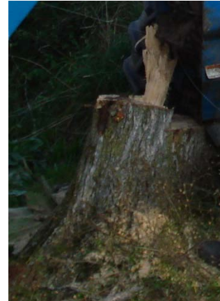
Figure 3. Locations of cuts made on tree stump

Remove the tractor from this task and the work activity was tree felling. Although experience can be a great teacher and a necessary element in skill development, misguided experience can foster poor technique and enhance bad habits. The decedent had experience, but his work practices, such as lack of wearing appropriate personal protective equipment (gloves only), and his felling technique (notch, backcut and hinge wood) did not adhere to consensus or MIOSHA standards for tree removal.