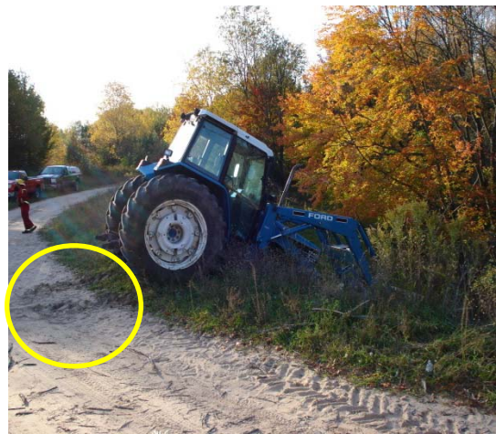
Figure 2. Driveway configuration and tractor position after moving forward when tree fell.

The decedent was facing the stump with his back to the tractor working under the raised bucket. It appears that when the decedent completed his cuts on the tree and the tree fell, the tractor rolled or fell forward over the edge of the driveway's drop off (Figure 2). The tractor tire marks are located within the yellow circle on Figure 2. The decedent, still holding the chain saw in his right hand, did not have enough time to react. The rolling/falling tractor was stopped by the stump of the tree the decedent had just cut, causing him to be pinned under the driver's side tractor tire. The medical examiner report indicated that there were skid marks from the back tires on the sandy driveway (See Figure 2).