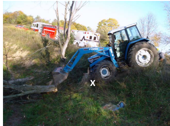
Figure 1. Position of decedent and tractor after tractor moved forward and down the embankment.

In the fall of 2010, a male farmer in his 60s died when he was pinned under the driver's side front tire of a Ford tractor Model number 7740 equipped with a loader bucket. A walking path for his pastured horses was located on a steep slope on the north side of a sand-packed driveway leading to his home. A damaged tree was close to this walking path and the decedent was concerned that, if the tree fell, it would cause injury to his horses. The decedent drove the tractor to the tree's location and stopped it with the front wheels at the top of the embankment slope. It is postulated that the decedent parked the tractor with the bucket raised slightly and resting against the tree to help direct the tree's fall. The tractor was running so as to keep the bucket raised and against the tree. The decedent got out of the tractor and cut the tree. When the tree began to fall, the tractor moved forward and down the embankment (Figure 1). The decedent was unable to move to safety and was struck by and pinned under the front end loader's driver's side front tire. His wife found him and called for emergency response. The decedent was declared dead at the scene.