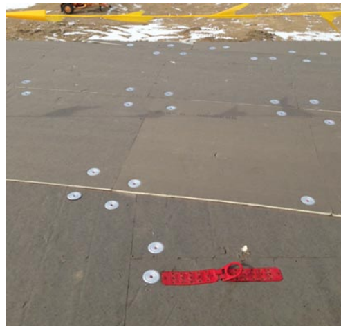
Figure 3. Roof anchor located inside of the warning line on northwest roof corner

The foreman left the roof to obtain more roofing material.