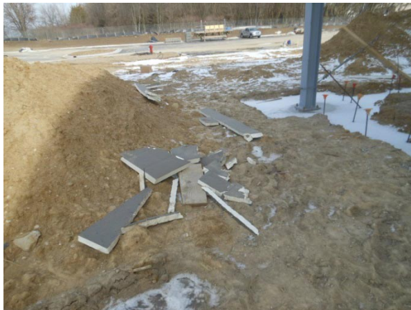
Figure 5. Two-inch rigid foam insulation which broke when decedent stood on it

Shortly after Coworker 1 left the roof, the decedent apparently wanted to help Coworker 1 finish trimming the insulation. With his harness in a bucket within the warning line area on the roof, the decedent proceeded outside of the warning line (Figure 4). Coworker 2 was on the roof working near the decedent. "Out of the corner of his eye", he saw the decedent stand up and unknowingly step onto a piece of tapered insulation that extended past the roofline. The cantilevered insulation was unable to support the decedent's weight and broke, causing the decedent to fall approximately 26 feet to the frozen ground below (Figure 5).