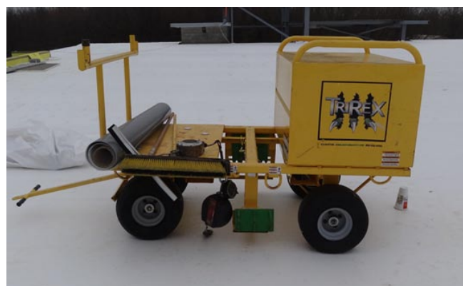
Figure 2. Fall arrest cart located on upper level

On site, the firm had a mobile fall protection cart which had locking pins for the wheels so it could be utilized on different sections of the roof (Figure 2). Additionally, the firm used a reusable roof anchor designed for use on steel roofs of 24-gauge or thicker if mounted with a minimum of 10 #8, ¾-inch long sheet metal screws per side on raised ribs of roof panel with pull in the long axis (Figure 3).