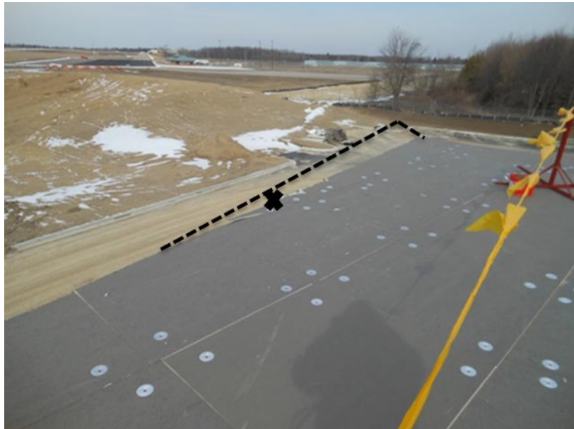
Figure 1. Roof location where decedent fell

In the winter of 2013, a male roofer in his 40s died when the cantilevered 2” rigid roof insulation he stepped on broke, causing him to fall approximately 26 feet to the frozen ground. The firm had a fall protection program including a safety monitor, warning line, and personal fall arrest system (PFAS). The foreman had dual responsibilities: installing insulation and acting as the warning line’s safety monitor. The decedent was not wearing fall protection while working