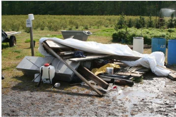
Figure 2. Overview of incident scene

The decedent built the structure approximately three years ago (2009) in the same location as the wagon. He used construction common-grade (non-pressure-treated) wood. The four 4" x 6" corner posts were 52" long. The upper platform supporting the water tank and the lower platform used as off-ground storage for tools were constructed with 2" x 6" wooden planks. The tank was located 4' 6" above the ground. A polyethylene plastic material was installed to enclose the south, east and west sides of the structure, leaving a north access to the