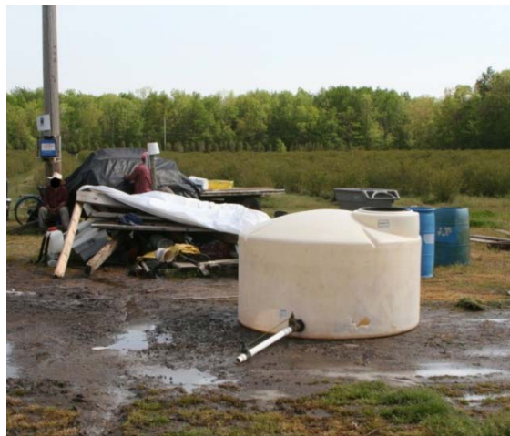
Figure 1. Overview of incident scene after moving the tank from the decedent

In the spring of 2011, a Hispanic male farm laborer in his 60s died when an elevated wooden structure with a nearly full 5½-foot diameter by 3½-foot tall plastic, 550-gallon water tank gave way causing the water tank to land on him. Both the decedent and the farm owner were on the incident site but working on independent tasks on opposite sides of the 13-acre blueberry/potted plant farm operation. The water tank was located on top of a storage platform built by the decedent approximately three years previously. The storage platform was constructed of construction common-grade lumber. Four 4”x 6” corner posts were 52” tall and flush with the ground. For both the upper platform to support the water tank and