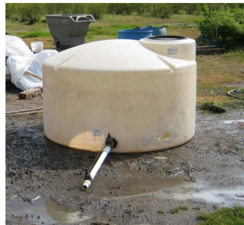
Figure 3. Water tank with hole in side

The sequence of events was unwitnessed. The owner and the responding sheriff department hypothesized that the decedent was retrieving some items within the storage area under the tank when the structure collapsed. One corner post was broken. The post either broke, causing the structure to collapse and the water tank to fall, or the post broke during the water tank's fall. The tank fell toward the open side that allowed access to the stored material. When the structure collapsed, the crash was