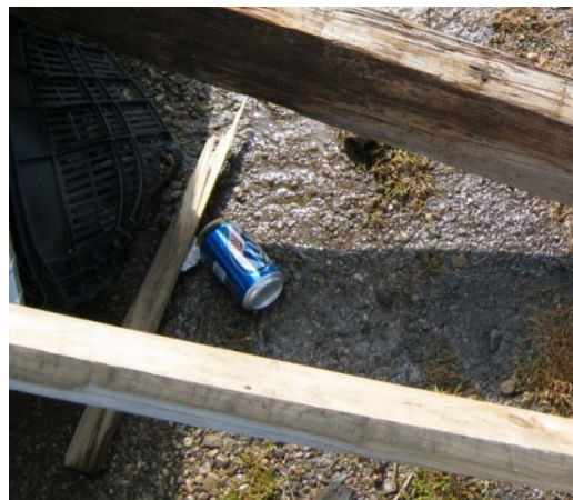
Figure 4. Beer can found at scene

Currently, there is no specific MIOSHA standard on this issue. Employers can create a drug- and alcohol-free workplace policy for their business by utilizing the U.S. Department of Labor's Drug-Free Workplace Adviser . The Adviser has 13 sections with questions that are completed by the employer. At the conclusion of the Adviser, a drug- and alcohol-free workplace policy is created based upon employer selections. The U.S. Department of Labor strongly recommends that a legal consultant, such as a labor/employment attorney,