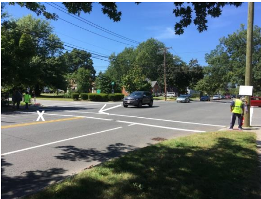
Figure 1 – Incident location. X marks victim location and the arrow indicates direction of travel of the vehicle.

The city provided the crossing guards with personal protective equipment (PPE) that included a stop paddle and an American National Standards Institute (ANSI) Class 2 compliant, high-visibility vest. The school department requires the use of these two pieces of PPE. If crossing guards wanted additional PPE, they had the option of purchasing items through the city contract. Crossing guards are provided with a new ANSI Class 2 vest annually and the stop paddles had to be inspected by the crossing guard supervisor to determine if it needed to be replaced.