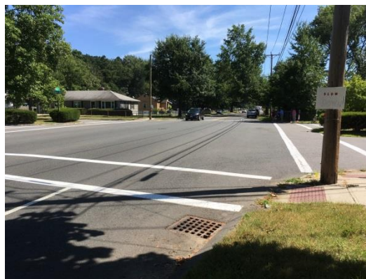
Figure 6 – Incident location. X marks victim location and the arrow indicates vehicle travel direction.