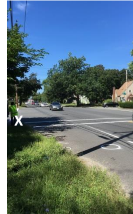
Figure 4 - Incident location. X marks victim's assigned location.