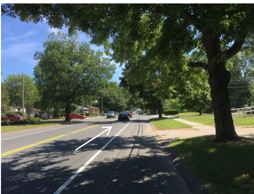
Figure 5 – Roadway leading up to the intersection. Note that there is no signage warning motorists of the crosswalk ahead.

The crossing guard was wearing the town provided ANSI Class 2 compliant high-visibility vest and was using the provided stop paddle. Two students walked up to the victim at the intersection in a northeast direction along the side street and needed to cross the main road. The crossing guard had the students stay on the sidewalk and then with the STOP paddle raised she stepped off the sidewalk and entered the roadway at the crosswalk location (Figure 6). She had walked in the crosswalk out to the middle of the travel lane closest to her, when she was struck by a motor vehicle traveling on the main road in a southeasterly direction. The victim landed in the roadway and the motorist stopped the car and stayed at the incident location.