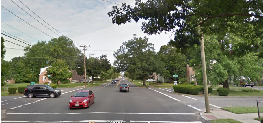
Figure 3 - Incident location. X marks victim location and the arrow indicates vehicle travel direction.