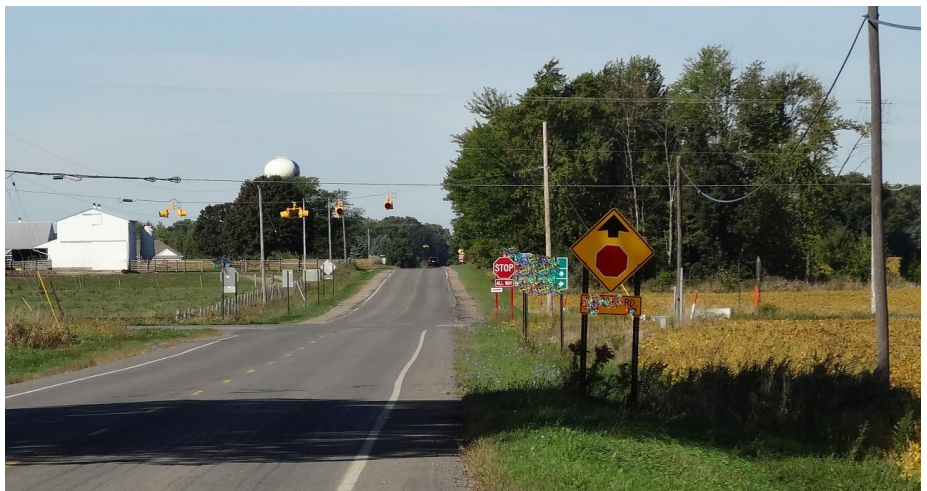
Photo 4. Flashing red light installed, 4-way stop indicated at intersection stop sign

Pickup #1's driver told the responding sheriff that he did not have a recollection of events leading to the crash. When responding sheriff asked Pickup #1's driver if he had observed the stop sign, the driver indicated that he didn't know there was a stop sign at the intersection. The responding sheriff asked him if he was using his cell phone at the time of the collision. He stated he didn't believe he had been and did not permit the responding sheriff to examine his mobile phone.