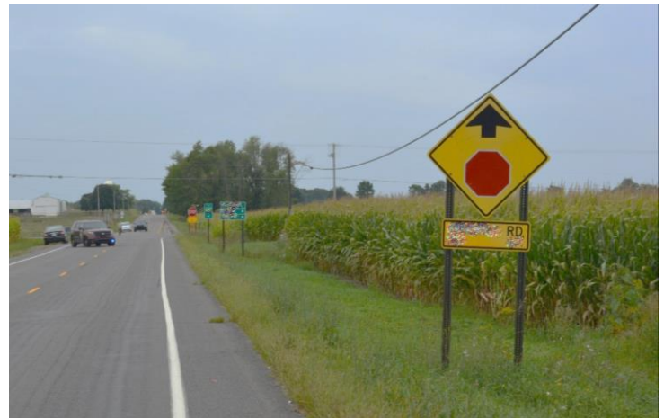
Photo 2. Looking west, advanced warning stop sign and additional roadway signage

The incident scene was a roadway intersection. The north-south and east-west roadways were dry, two-lane blacktop chip-sealed asphalt with posted speed limits of 55 mph. The north-south roadway had the right of way. The east-west roadway had a stop sign at the intersection with affixed signage indicating crossroad traffic does not stop (Photo 1). Additionally, an advanced warning stop sign with the name of the intersecting road was positioned west of the intersection on the north side of the westbound roadway (Photo 2). Westbound traffic, as it neared the intersection, had corn fields on each side; the visibility of the upcoming intersection and signage was not obscured by the crops. The corn fields interfered with both the north/south and westbound drivers to identify traffic approaching the intersection.