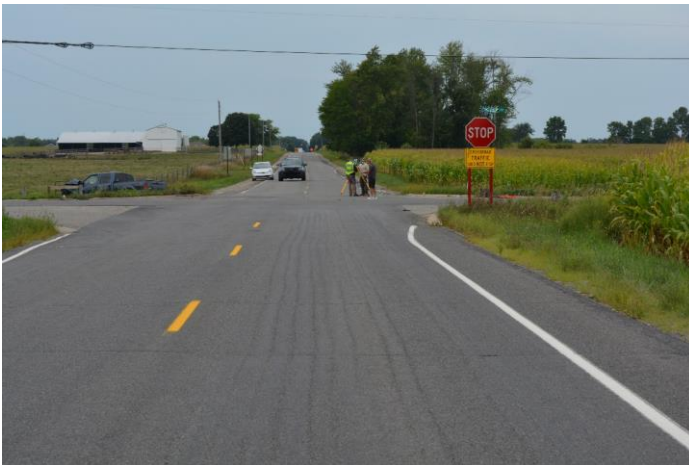
Photo 1. Looking west, approaching intersection. Stop sign noting cross road traffic does not stop