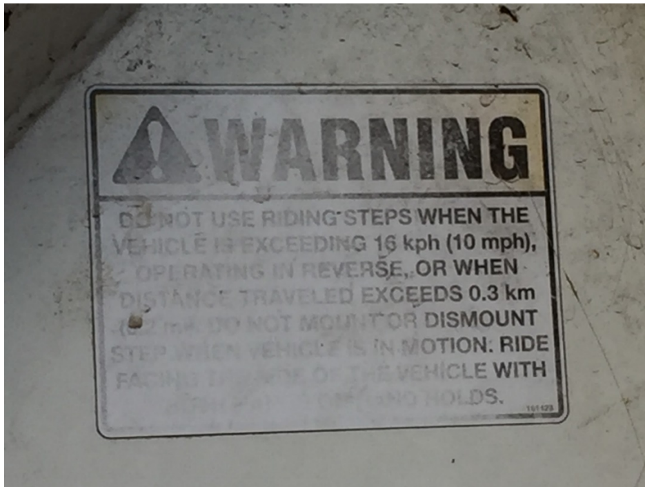
Photo 1. The warning sign on the refuse collection truck was faded with illegible wording.

Two riding steps were mounted at the rear of the truck, one on each side. The steps were 32 inches long by 10 inches wide, and 17 inches above the ground. There were two warning signs attached to the truck stating: “Do not use riding steps when the vehicle is exceeding 16 kph (10 mph), operating in reverse, or when distance traveled exceeds 0.3 km (0.2 mi). Do not mount or dismount step when vehicle is in motion. Ride facing the side of the vehicle with both hands on hand holds.” The warning sign on the left side of the truck was faded, making some of the wording illegible (photo 1).