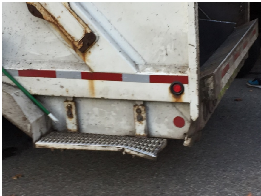
Photo 2. The riding step on driver's side of the refuse collection truck was bent.

should ever ride on the steps if the steps are damaged, bent or broken. The step on the driver's side on this truck was bent (photo 2).