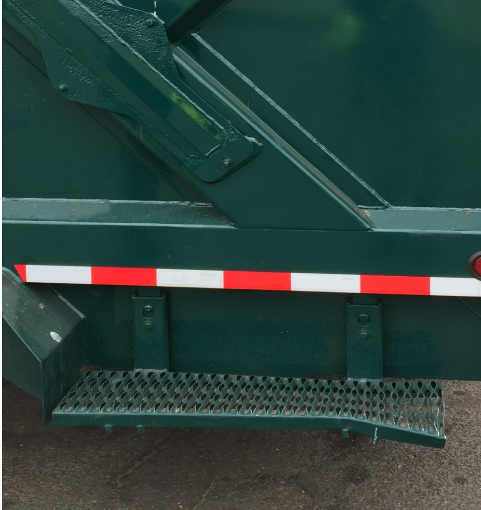
Photo 4. Fifteen months after the fatal incident, the refuse collection truck that was involved in the incident was painted and fitted with a new compactor. The bent step was still not repaired (Photo courtesy of PESH).