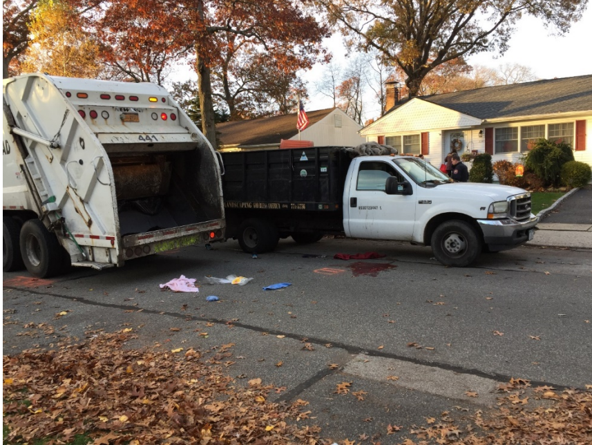
Photo 3. The victim was crushed against the lawn service truck while riding the refuse collection truck on the right riding step when the refuse collection truck was backing up.