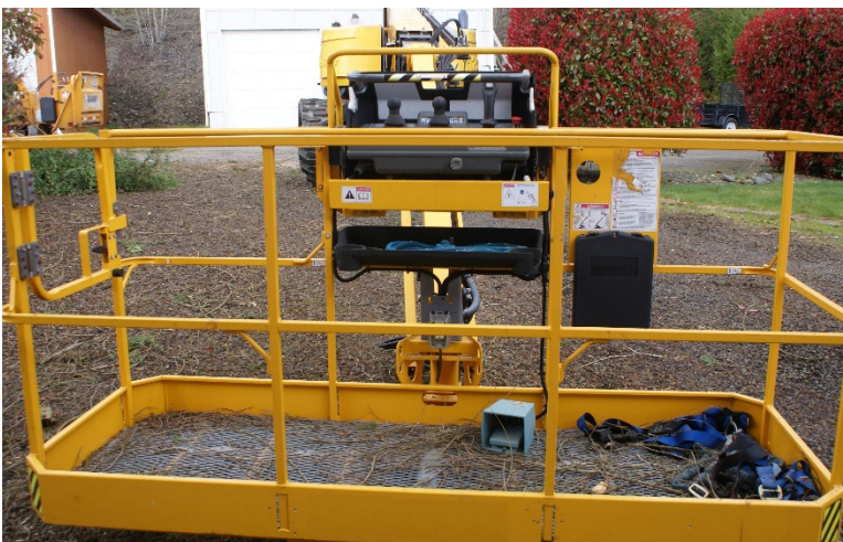
Photo 6: View of front of boom lift basket. The basket had a capacity rating for two workers or a maximum of 500 lbs.

Shortly after arriving on site, the operator and his coworker entered the basket (see photo 6). The operator controlled the boom lift from the basket and elevated it to approximately 20 feet above the ground where they could reach the lower limbs of the tree. The bottom of the basket was approximately 12 feet above the roof of the shed. They decided they needed to pull the cut branches into the basket to keep them from falling and damaging the roof of the garage and the shed. The company owner remained on the ground to operate the chipper.