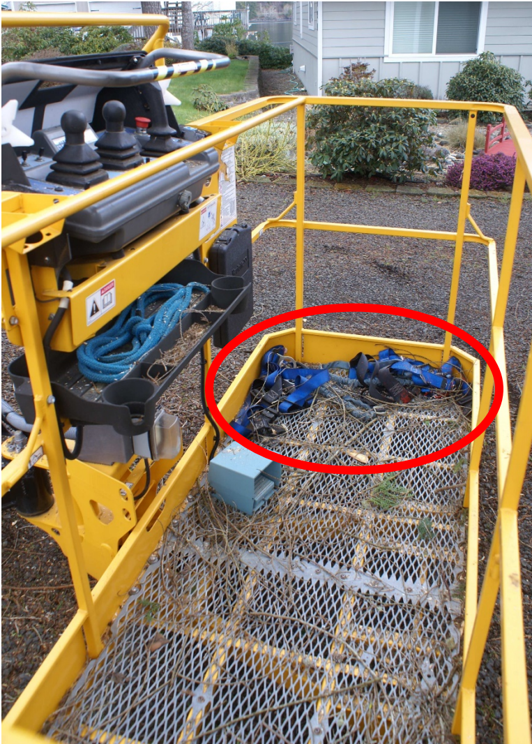
Photo 7: The two rented fall protection harnesses in the boom lift basket (circled). Also pictured are the control panel and the foot pedal that was required to be depressed in order to operate the basket.

They were wearing hard hats, safety glasses, and safety boots so there was an awareness of and attention to safety hazards. It is unknown if they were using any other safety equipment at the time of the incident. They were not wearing their fall protection harnesses even though they were in the basket (see photo 7).