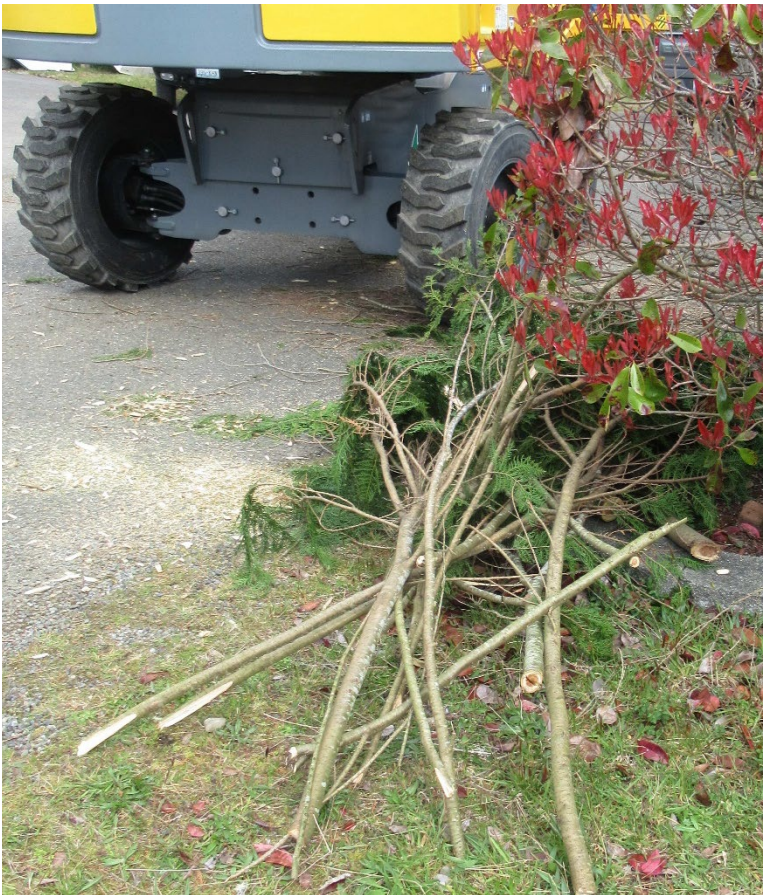
Photo 10: Some of the smaller limbs that the workers collected into the boom lift basket.

The remains of the cut limbs on the tree indicate that some of the limbs they had cut may have been several inches in diameter. This may have made the limbs difficult to bring into the basket. Some of the smaller limbs can be seen in photo 10. There is no evidence that the boom lift basket moved or shifted prior to the operator falling.