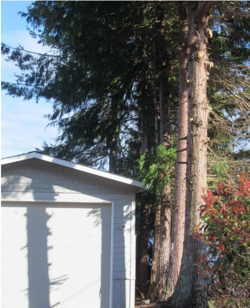
Photo 3: Incident scene garage of residence that hired the employer to remove the trees. Workers were in the process of limbing the tree on the right side of the garage in preparation to remove the tree when the operator fell from the basket.

The employer rented the boom lift, the wood chipper, and the personal fall protection gear that they needed to do the job. The boom lift was a Haulotte, model number HT67RTJO. The boom lift basket was rated for two workers or a maximum weight of 500 pounds. Their fall protection consisted of two personal fall protection harnesses and lanyards.