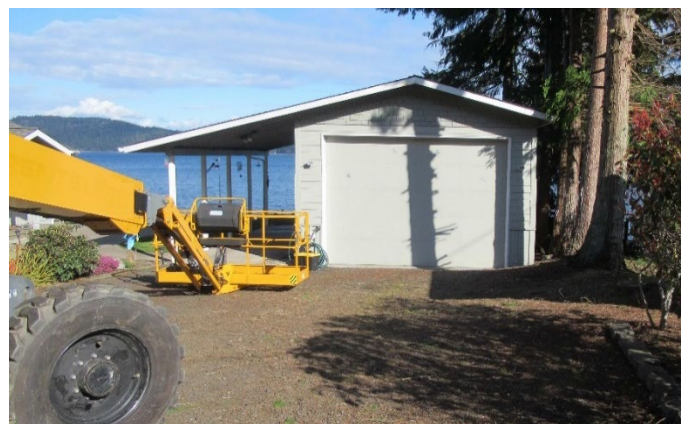
Photo 2: Incident scene driveway and garage of residence. Workers were in the boom lift basket limbing trees on the right side of the garage.