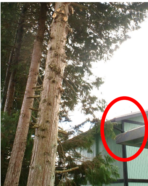
Photo 4: Tree that workers were in the process of limbing. The building on the right side of the tree is the adjacent residence. The roof of a small shed can be seen in the foreground (circled). The limb scars indicate that some of the limbs were several inches in diameter. Note the amount of space between the tree and the structures that would have allowed the crew to rig and lower cut branches to the ground.

The area where they needed to locate the boom lift basket to work was between the garage of the residence whose owner contracted the job and the home and shed of the adjacent residence. The shed was 8 feet tall and located in front of the garage (see photo 4). This meant they would need to position the boom lift basket above the garage and the shed in order to limb the trees.