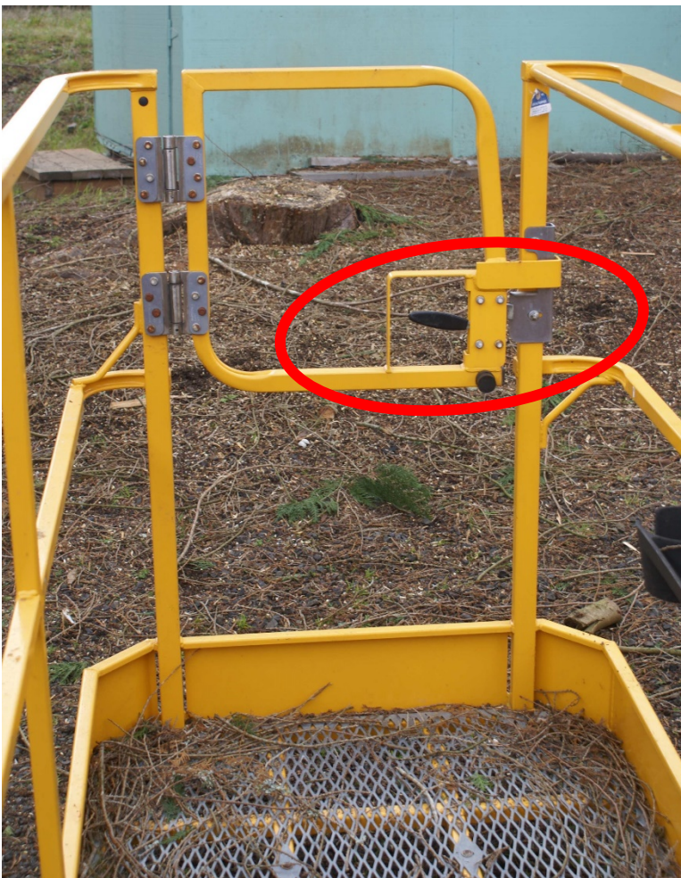
Photo 8: View of side access gate of boom lift basket. The gate had a mechanical latch (circled) and swung into the basket when opened. Note that the toe board is in place.

The coworker was cutting branches with his chainsaw while the operator was pulling the branches into the basket. They were doing this for approximately an hour. The operator opened the side access gate of the basket (see photo 8) in an attempt to get some branches into the basket. The coworker said he was reaching down to pick up his chainsaw when he saw the operator fall from the basket onto the roof of the shed 12 feet below (see photo 9). It is unknown if the operator was leaning outside of the basket and lost his balance while trying to maneuver limbs into the basket or tripped over branches in the basket or the toe board.