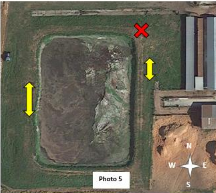
Photo 5: Aerial view of the rectangular manure pond where incident occurred. Red X shows tractor rollover location. Yellow arrows indicate the uneven, rutted, dirt track road on the elevated crest of the pond’s earthen embankment. The pond area was dark, and the embankment road had no lighting system, hazard signs, or reflective markers.

The incident happened at the northeast corner of the earthen embankment that surrounded the dairy farm’s manure pond, where cow waste solids were stored for future use as soil fertilizer. The rectangular pond was around 130 feet wide and 260 feet long. On the elevated crest of the embankment was a narrow, bumpy, rutted dirt track road (Photos 5-6). The embankment had a 25-degree outer slope covered with tall grass (Photo 7). A dirt road from an area of farm buildings extended west across the pond’s north side and ended near its northwest corner. The pond area was dark when the incident occurred, and the only light came from the tractor and farm buildings east of the pond.