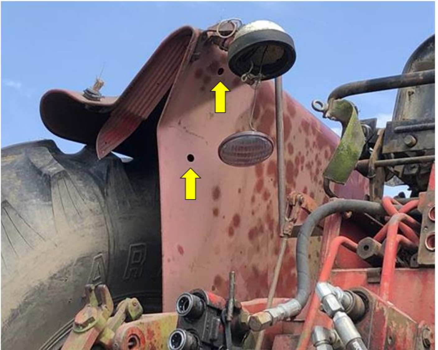
Photo 9: Arrows point to manufacturer-made openings to accommodate ROPS installation on incident tractor. During ROPS installation, the fenders are removed, the ROPS is mounted to the axle housing, and the fenders are secured to the ROPS using the holes. Washington State agriculture workplace safety rules require ROPS for pre-1976 tractors that were built or sold with ROPS as an optional accessory; or according to the manufacturer, the tractor was designed to accommodate the addition of ROPS.