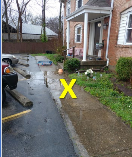
Photo 3. Location of fall indicated by yellow X

indicated by a yellow “X” in Photo 3. (Note: Weather conditions on the date of the fatal incident differ from those seen in Photo 3 because the photo was taken later.)