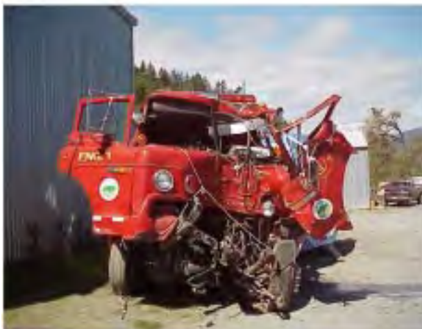
Engine Involved in this Incident

The Fire Fighter Fatality Investigation and Prevention Program is conducted by the National Institute for Occupational Safety and Health (NIOSH). The purpose of the program is to determine factors that cause or contribute to fire fighter deaths suffered in the line of duty. Identification of causal and contributing factors enable researchers and safety specialists to develop strategies for preventing future similar incidents. The program does not seek to determine fault or place blame on fire departments or individual fire fighters. To request additional copies of this report (specify the case number shown in the shield above), other fatality investigation reports, or further information, visit the program website at