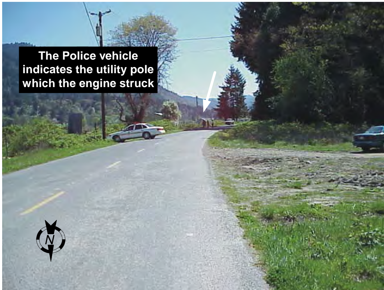
Photo 3. The Road Which the Engine Was Traveling. Note: This photo depicts the opposite direction of travel with the engine coming toward the police vehicle. The arrow indicates the approximate location which the engine left the roadway.