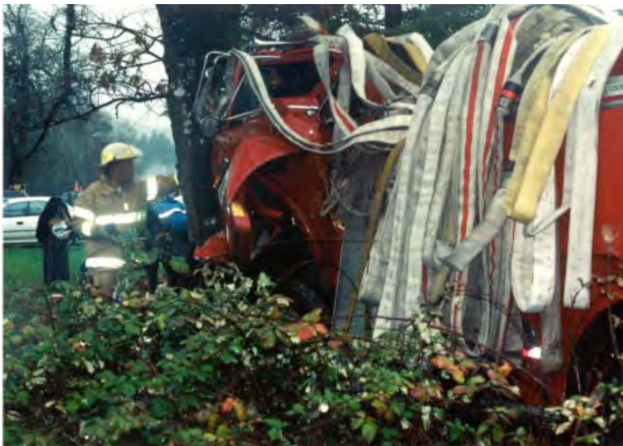
Photo 2. The Engine Involved in This Incident