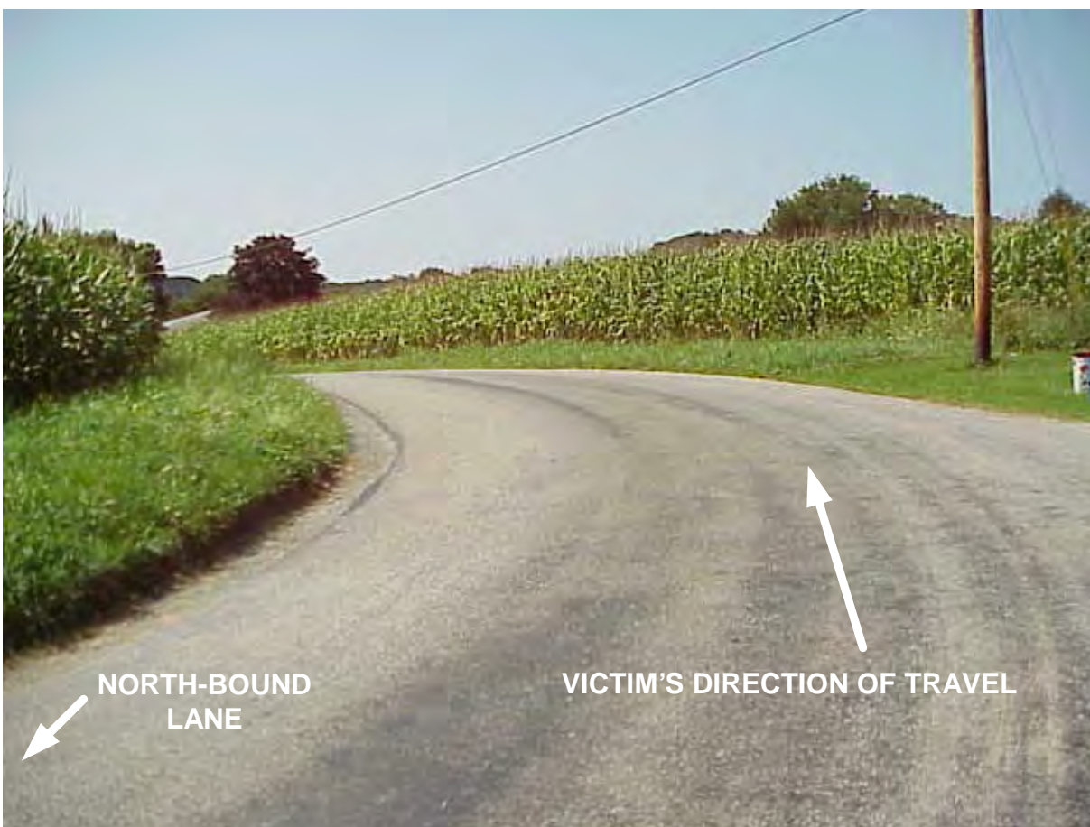
Photo. View of Curve Traveling Southbound