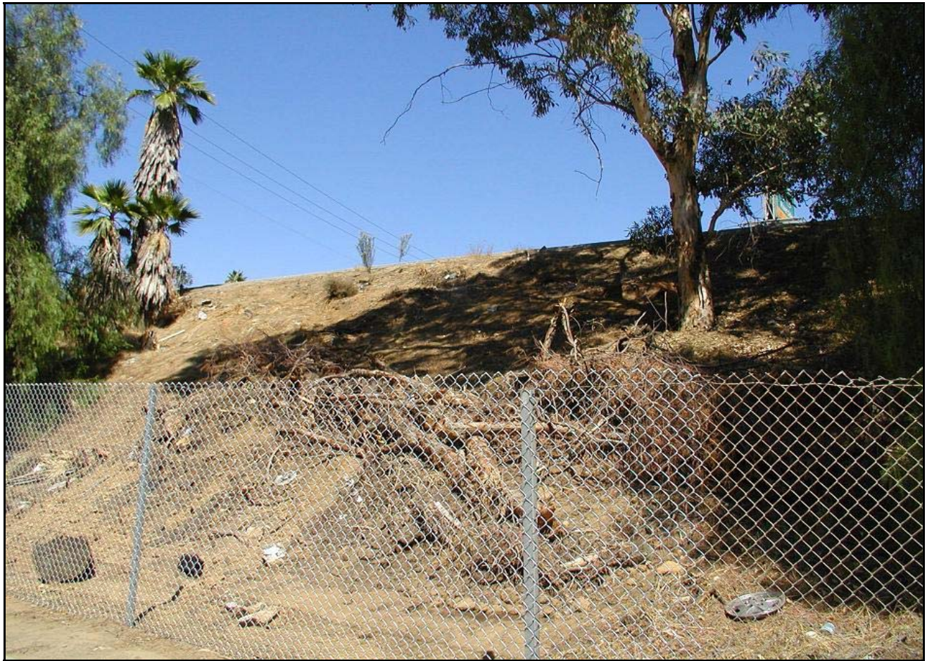
Photo 2. View of incident site