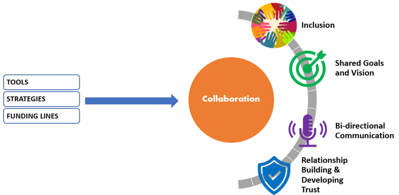
FIGURE 1: Framework to Foster Collaboration