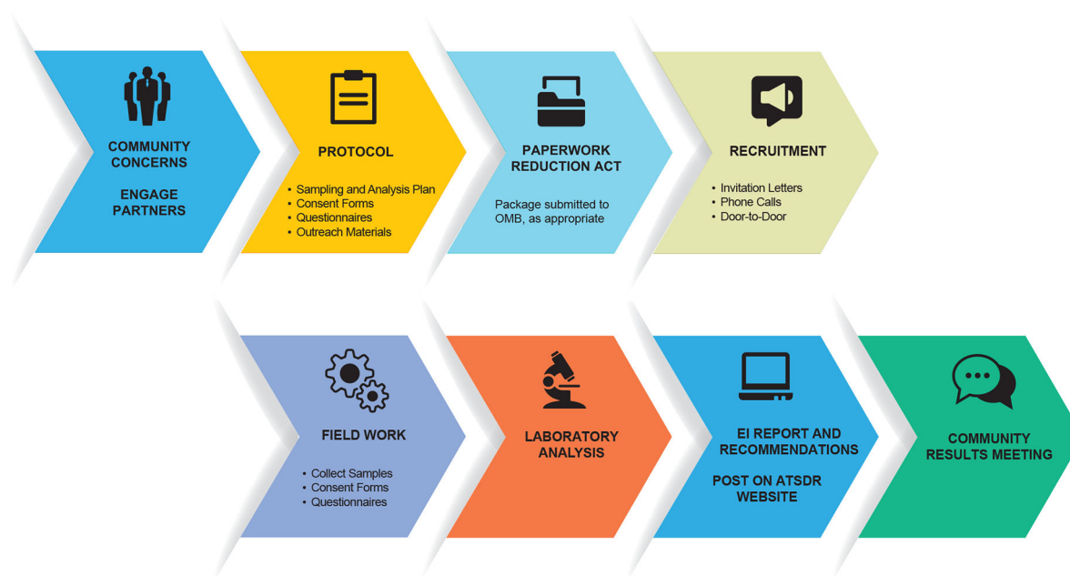
FIGURE 1. The Exposure Investigation (EI) Process

Note. ATSDR = Agency for Toxic Substances and Disease Registry; OMB = Office of Management and Budget.