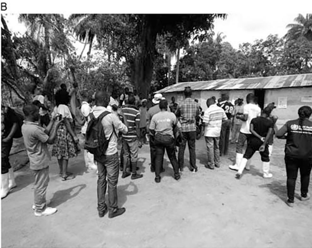
Figure 2. In-Person Interactions between Margibi County Health Team and Actively Monitored or Quarantined Villages.

Panel A. Re-integration ceremony for Patient A at Village A. The Margibi County Health Officer explains to Village A residents that Patient A is Ebola-free and should be welcomed back into her community as an ambassador in the fight against Ebola (February 24, 2015). Panel B. The Margibi CHT explains to a village that their active monitoring period is complete, but that they should refrain from entering Village A until Village A's quarantine period is complete.