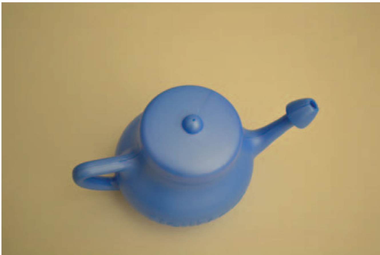
Figure 1. Neti pot.