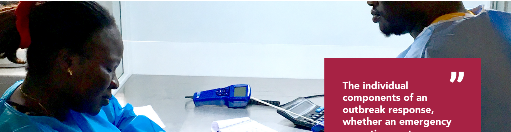
National Public Health Institute of Liberia (NPHIL) engineers participating in a biosafety cabinet certification program. The training was supported by CDC's NPHI Program in partnership with the Association of Public Health Laboratories and the Eagleson Institute.