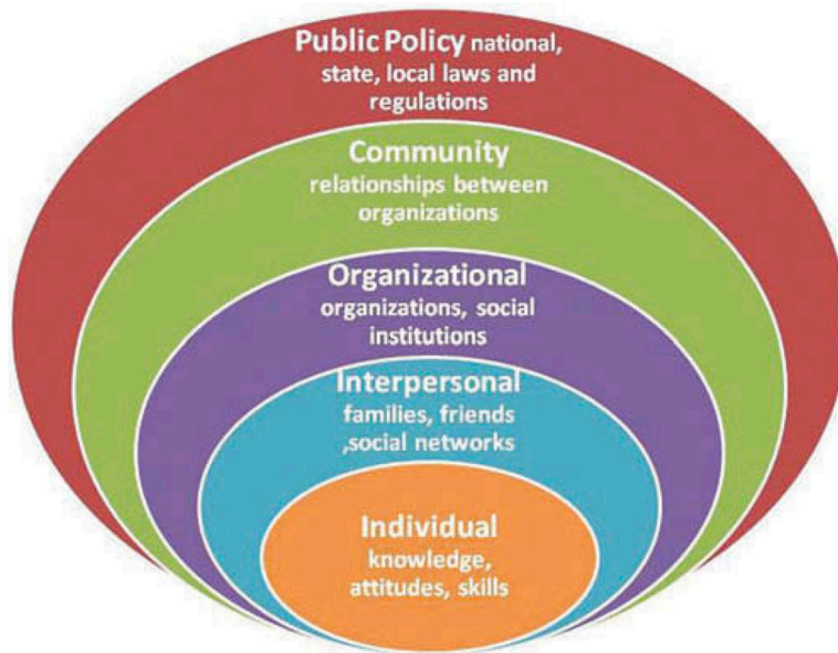
Figure 1. Socio-ecological model: framework for prevention, centers for disease control. Available from the Centers for Disease Control and Prevention (CDC). http://www.cdc.gov/violenceprevention/overview/social-ecologicalmodel.html . 4