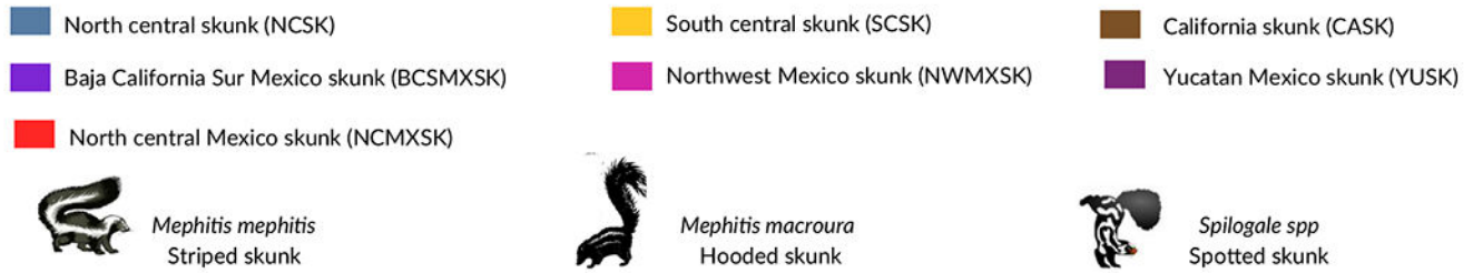
FIGURE 1. Geographic distribution of major skunk rabies epizootics in North America with most likely putative reservoir host species.