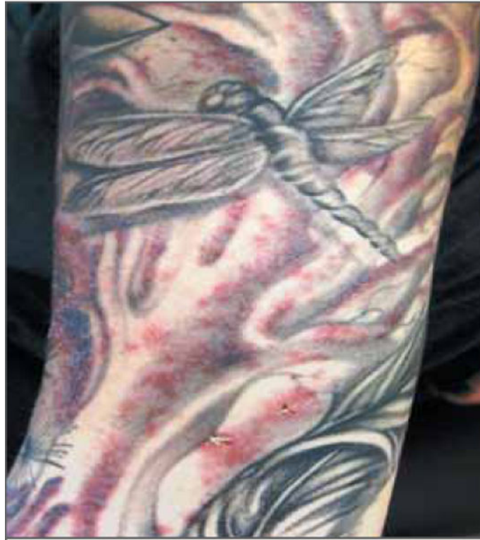
Figure 2. Typical Rash Associated with Mycobacterium chelonae Infection.