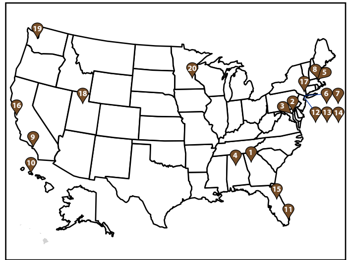
FIGURE 2. U.S. GeoSentinel sites* — GeoSentinel Network, 2012–2021

* Sites include Atlanta, GA (1); Baltimore, MD (2); Bethesda, MD (3); Birmingham, AL (4); Boston, MA (5); Bronx, NY (6); Bronx Lebanon, NY (7); Cambridge, MA (8); Hollywood, CA (9); Honolulu, HI (10); Miami, FL (11); New York City, NY (12); New York Northwest, NY (13); New York West, NY (14); Orlando, FL (15); Palo Alto, CA (16); Peekskill, NY (17); Salt Lake City, UT (18); Seattle, WA (19); and St. Paul, MN (20).