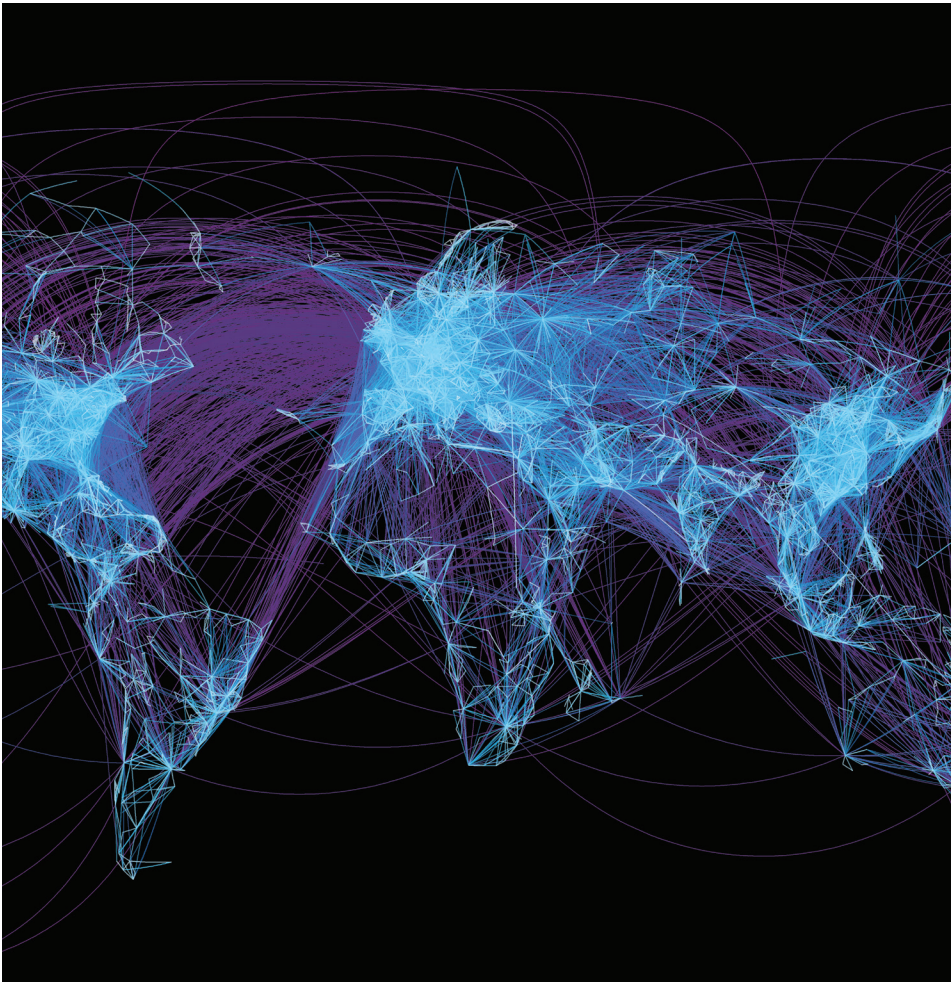
The flight map shows ~60,000 flight patterns in a 24-hour period. Blue lines are shorter flights; purple lines longer flights.