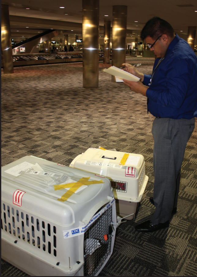
A public health officer reviews rabies vaccination records for dogs imported into Detroit from overseas.