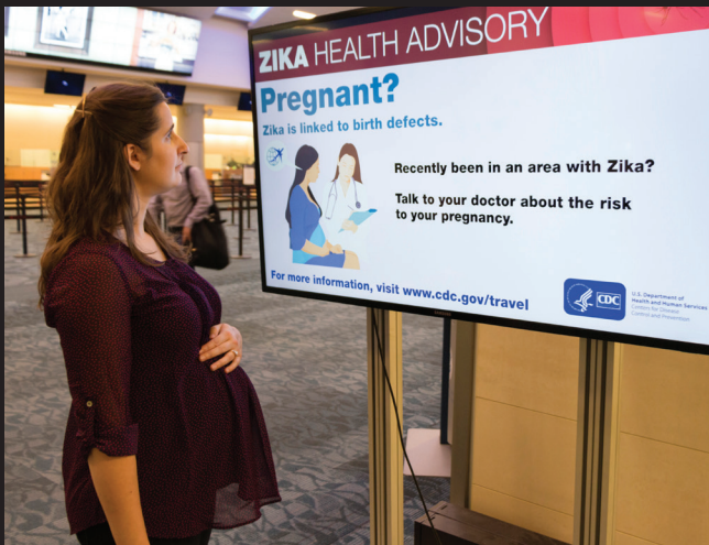
NCEZID provided guidance to pregnant women during the outbreak of Zika.