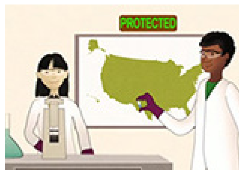
Video 1: Click on the image to watch a video on 'What is a public health laboratory?'

There are two generalizable categories of public health laboratories 2 that address environmental health issues. Environmental laboratories assure the safety of water, soil and air through testing for chemical, biological or radiological agents and other contaminants. Environmental health laboratories measure levels of chemicals in human tissues and fluids to assess potential environmental exposure (otherwise known as biomonitoring). iii