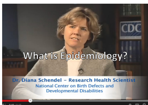
Video 2: What is Epidemiology? Credit: CDC, National Center on Birth Defects and Developmental Disabilities

Most US states and territories and the District of Columbia have a central public health laboratory that resides within or serves as a part of the state's public health agency. Many states also have local public health laboratories to serve a metropolitan city or a region. iv Environmental laboratories may or may not reside in the public health agency. When laboratories are not located within the public health agency or in close proximity, distance may act as a barrier for collaboration.