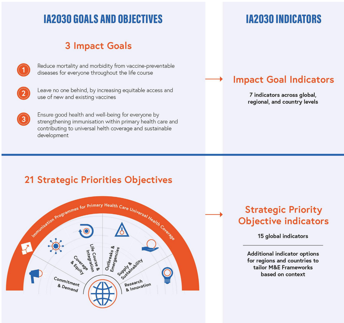
Fig. 2. IA2030 Goals, Objectives, and Indicators.