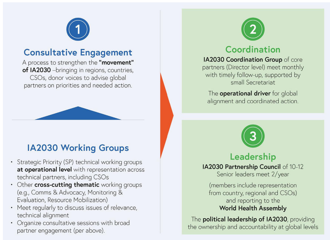
Fig. 4. The three components to IA2030 global level O&A model.