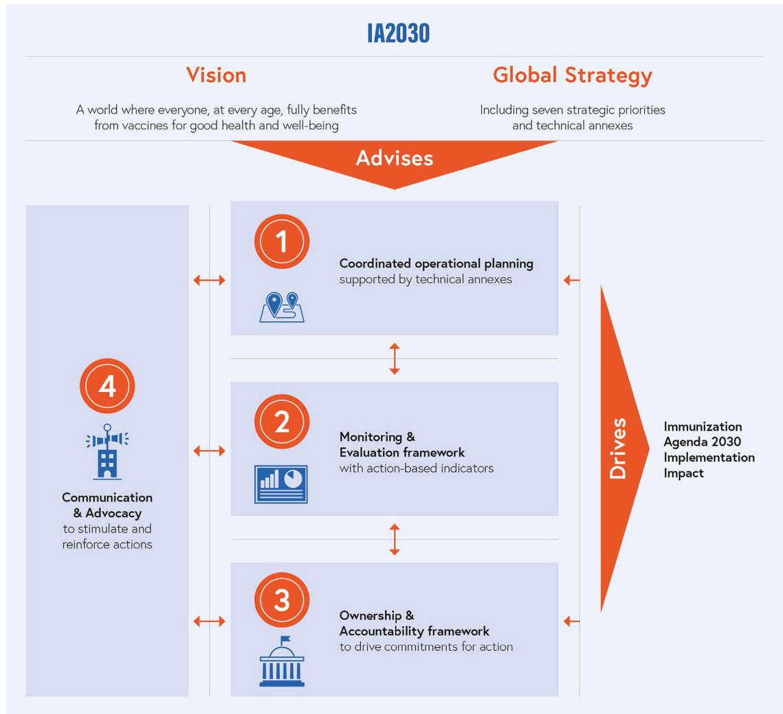
Fig. 1. IA2030 Framework for Action with four operational elements to drive implementation.