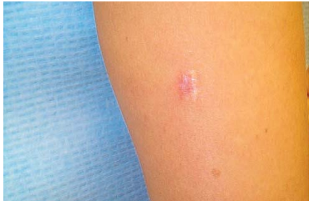
Figure 1. Photomicrograph of keloidal skin lesion on patient's right upper arm.

The patient had spent time doing geologic work in various tropical regions over a 7-year period. In 1992–1993, she traveled to the Four Corners region of the United States as well as to California, northern Mexico, and Costa Rica. She lived and worked in the jungles of Guyana and Venezuela for 2 years (1993 and 1994), spending most of her time around the Cuyuni, Essequibo, and Rupununi River areas, although she also spent some time in the Bolivar state of Venezuela. Thereafter, she traveled to Kazakhstan, Indonesia (Irian Jaya), and the Philippines