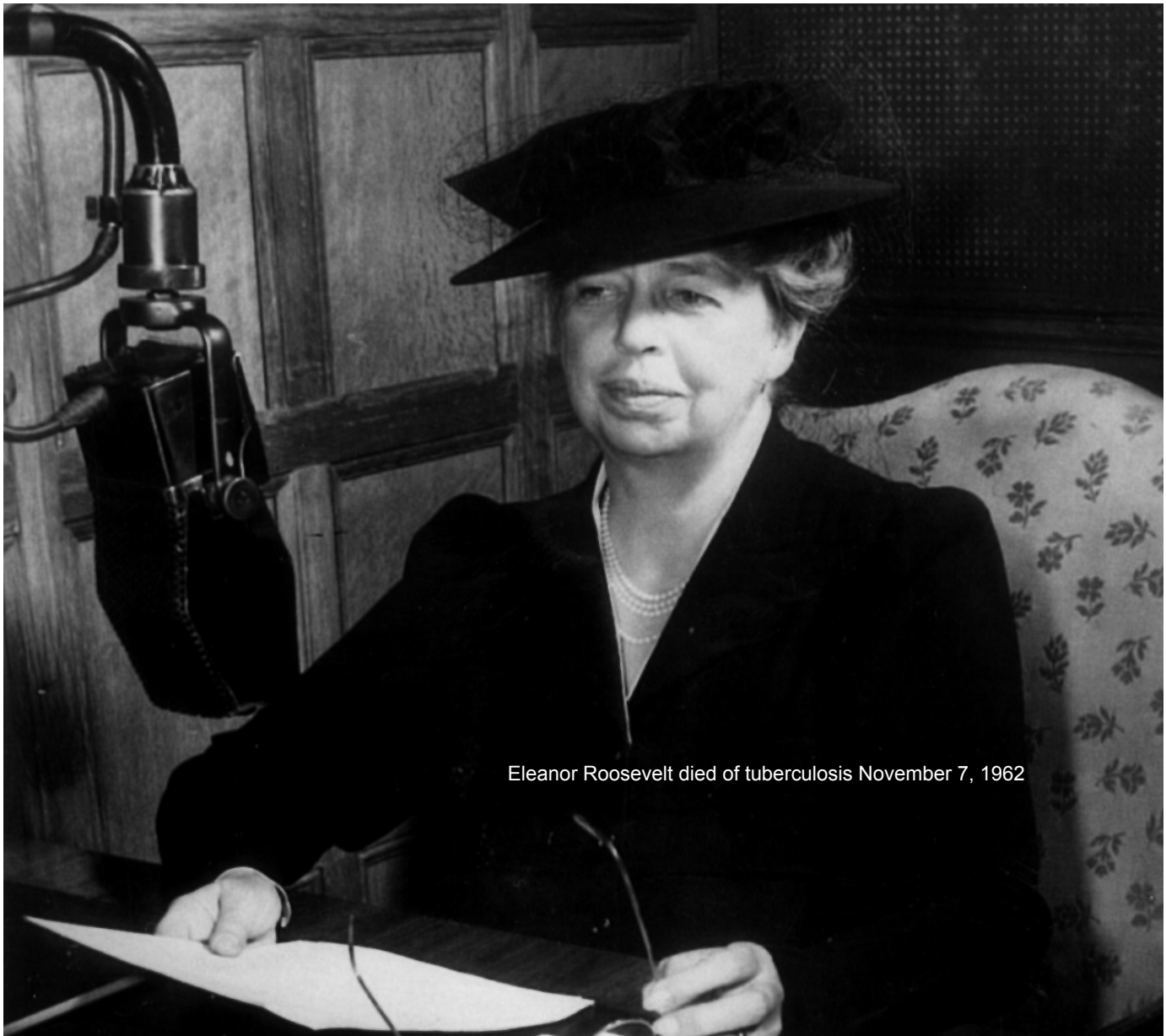
Eleanor Roosevelt died of tuberculosis November 7, 1962