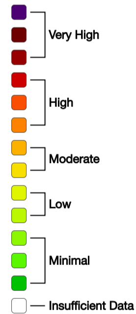
ILI Activity Level