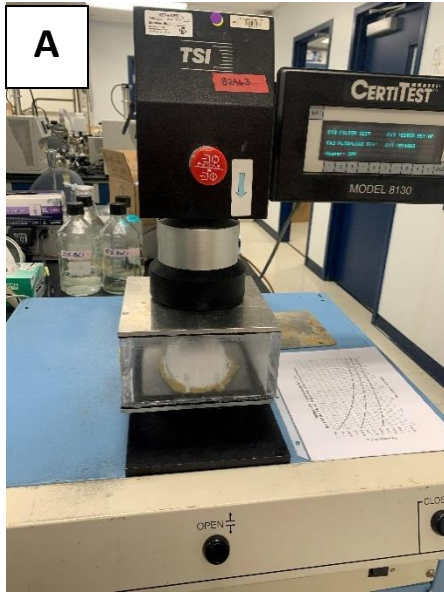
Fig. 1A TSI 8130 Filter Tester