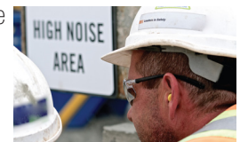
Worker using earplugs for hearing protection.

Make sure your hearing protection fits and is comfortable. The louder the job, the more hearing protection you need.