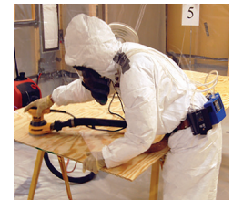
Photo: Worker with full protective gear conducting CPWR test inside a special chamber using a dust collection system

NIOSH and CPWR have demonstrated that dust collection systems attached to tools will reduce the number of nanoparticles along with normal dust. Wet methods will work too.