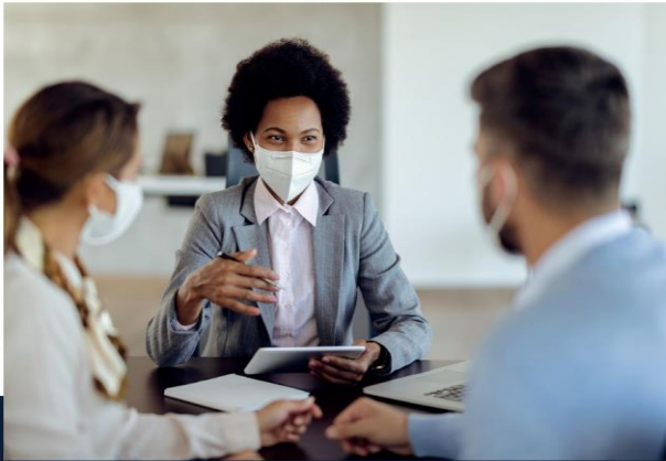
Statewide Training Approaches for Community Health Workers

WHAT IS INCLUDED IN THE CHW DOCUMENT RESOURCE CENTER?