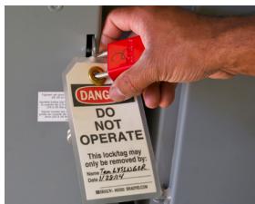
A machine being locked and tagged out.

▶ A lockout device is a key or combination lock that prevents equipment from turning on or moving unexpectedly.