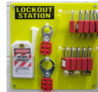
Examples of LOTO devices