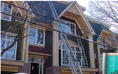
A painter was electrocuted when a metal ladder came in contact with a powerline.

Aluminum conducts electricity. A fiberglass ladder is a better choice when working near electricity.