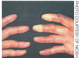
Hand Arm Vibration Syndrome