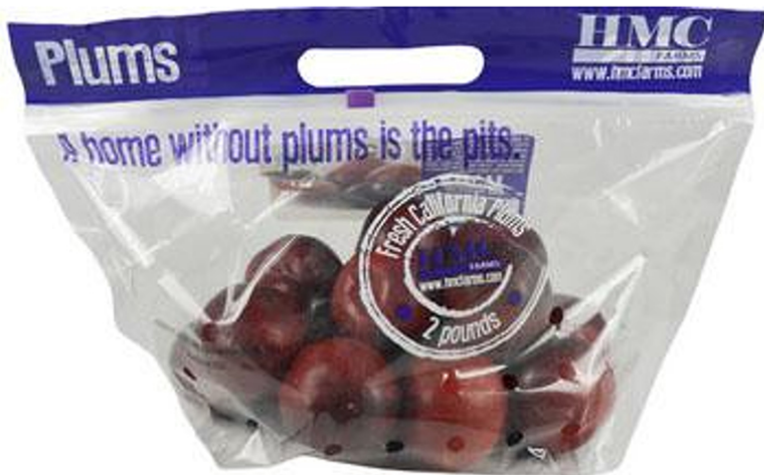
One of the recalled bagged plums