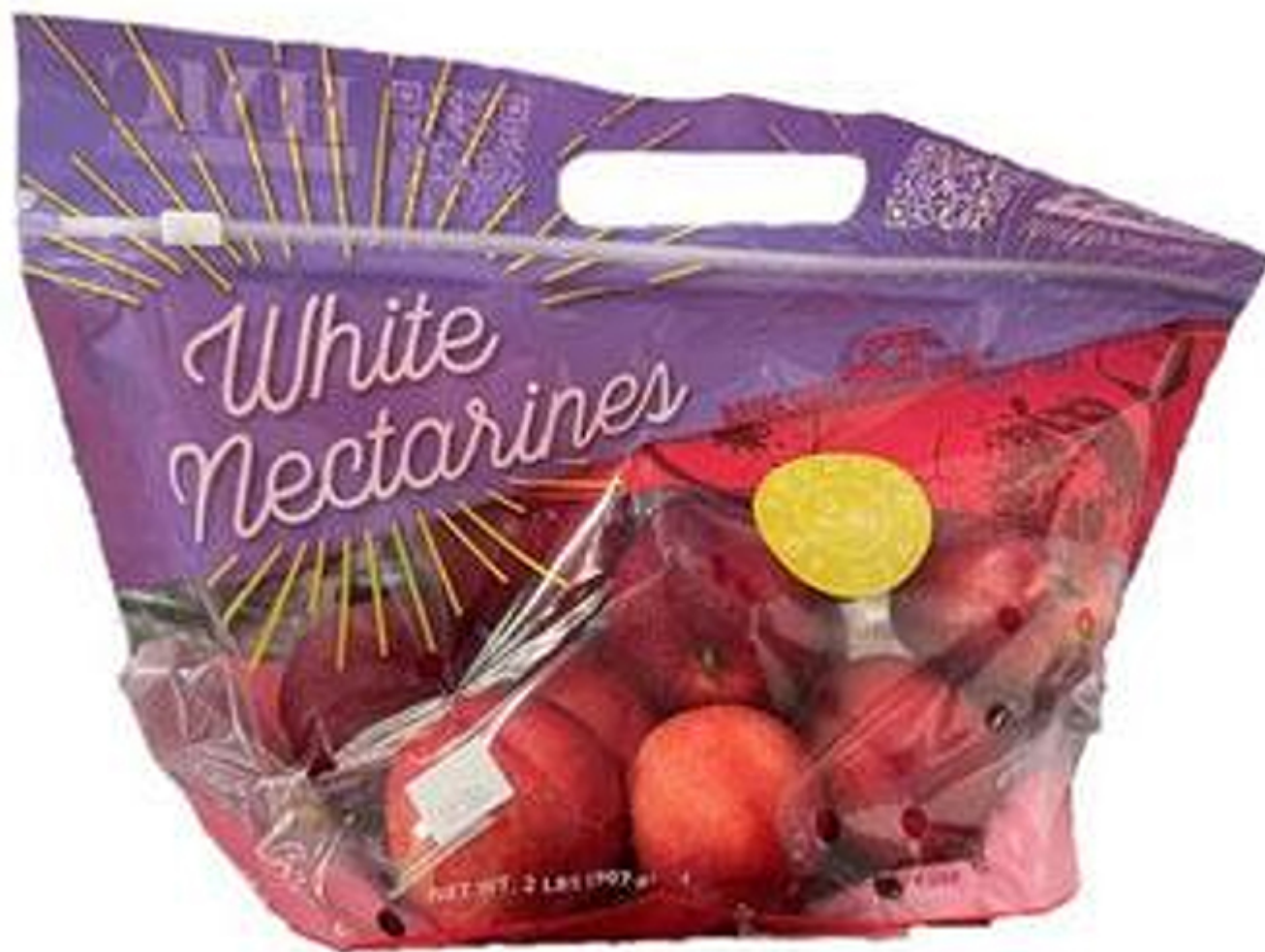
One of the recalled bagged nectarines