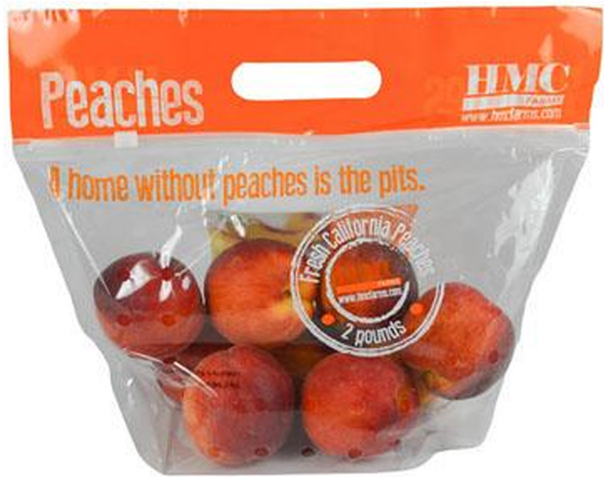
One of the recalled bagged peaches