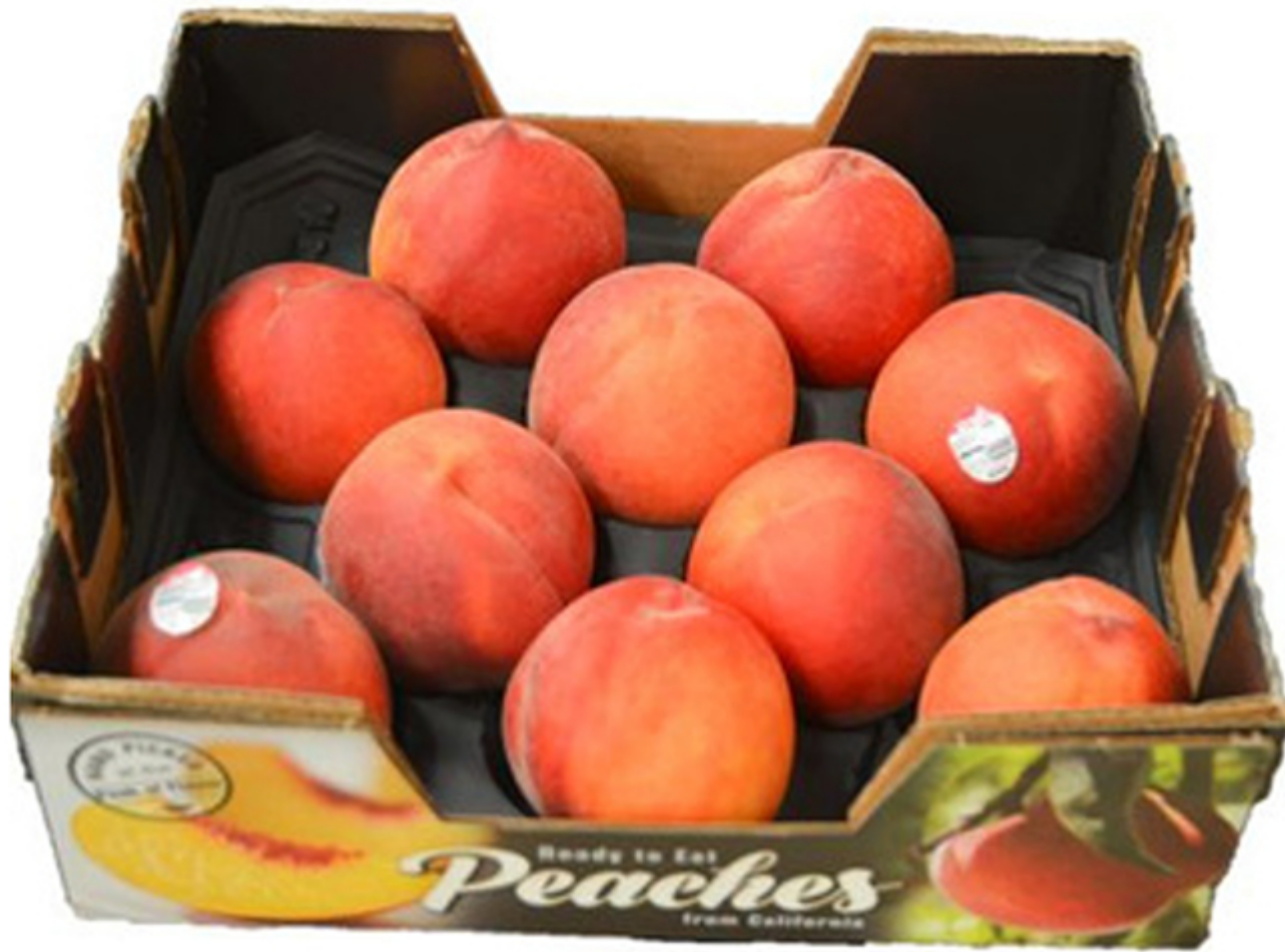
Recalled individual peaches