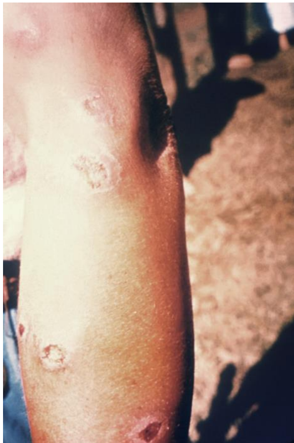
Figure 3. Multiple crater ulcers on this patient's left arm, due to leishmaniasis. Note the various stages of the ulcers, up and down the arm, with some undergoing resolution, leaving behind a depressed, crater-like scar, and others in an erythematous inflammatory phase, revealing their reddened, scabby interiors.

B, Mohammadi MA, Salarkia E, et al. A long-lasting emerging epidemic of anthroponotic cutaneous leishmaniasis in southeastern Iran: population movement and peri-urban settlements as a major risk factor. Parasit Vectors . 2021;14(1):122.