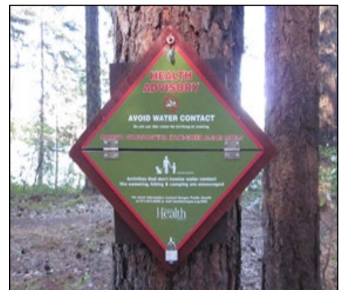
Health Advisory Sign Near Water

Visit your state government website to find out more information about water testing and beach closures in your area. Some states provide information on state laboratory testing as well as other environmental and health information.