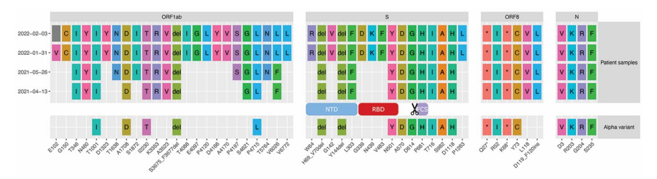
Appendix Figure 2. Amino acid substitutions, deletions, and insertions over time. Mutations are compared to Wuhan-Hu-1 (NC_045512.2). FCS, furin cleavage site; NTD, N terminal domain; RBD, receptor-binding domain.