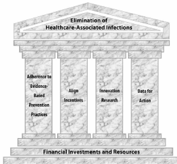
Figure 1. Framework for the elimination of healthcare-associated infections.

Elimination of HAI requires a public health model of constant action and vigilance to promote adherence to evidence-based practices; alignment of incentives and reinvestment in successful strategies; filling knowledge gaps to respond to known and emerging threats through research; and collecting data to target prevention efforts and to measure progress. These efforts must be underpinned by sufficient financial investments and resources (Figure 1). 2