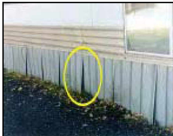
Fix gaps in trailer skirtings