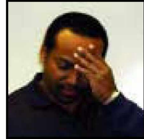
Fever, fatigue, and muscle aches are the first symptoms of HPS

In the United States, there has never been a case in which a person with HPS has given the disease to another person.