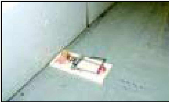
Place trap so it makes a "T" with the wall