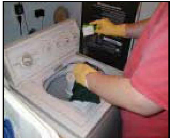
Wash clothes and bedding with detergent in hot water