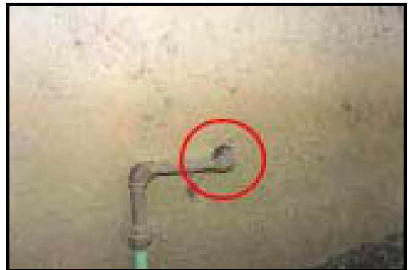
Look for gaps around pipes outside your home