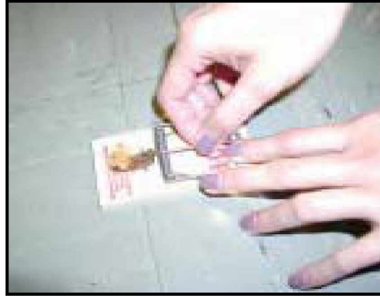
Use peanut butter on traps.