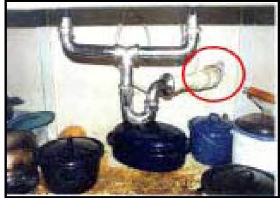
Look for gaps where the water pipes come into your home