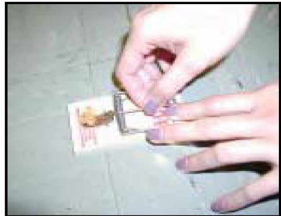
Use peanut butter on traps.