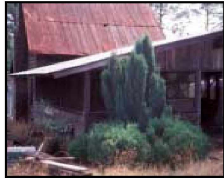
Air out cabins