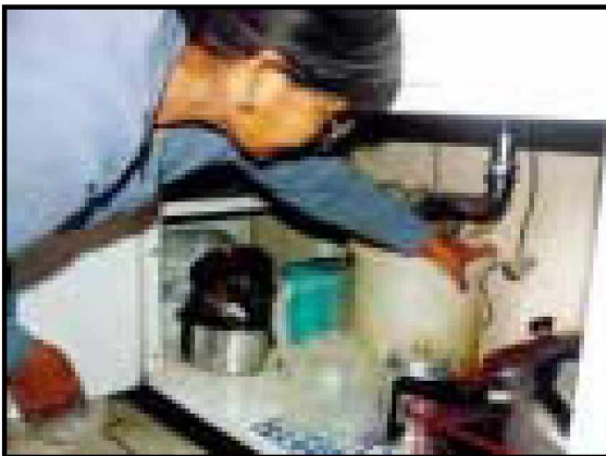
Look for holes.