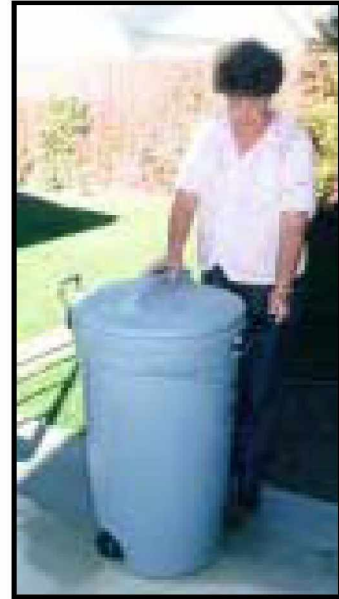
Use a trash can with a tight lid