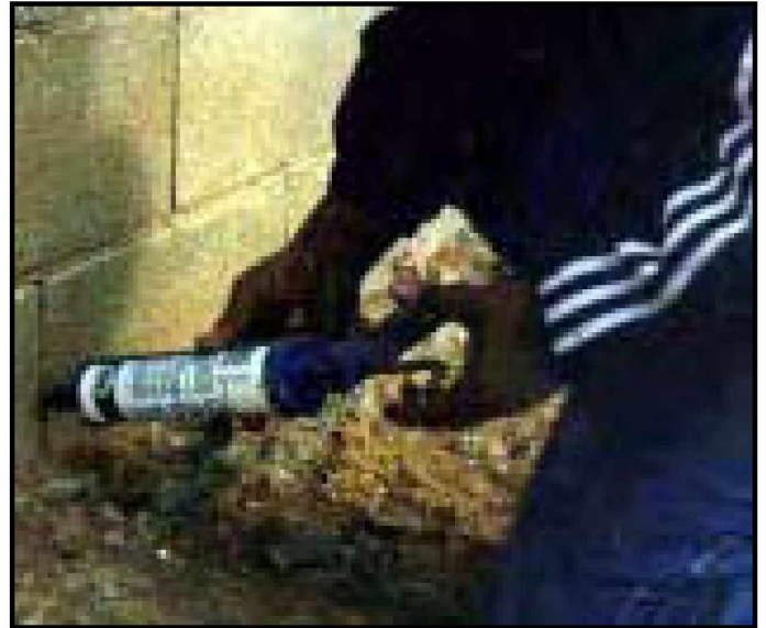
Seal holes with caulk