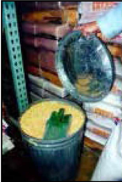
Keep animal feed in a container with a tight lid