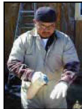
Spray gloves before taking them off