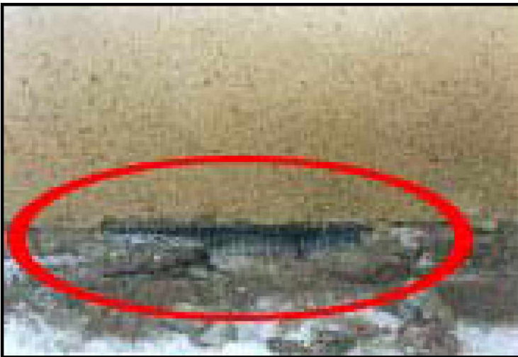
Fold lath metal and place in holes in the foundation of houses