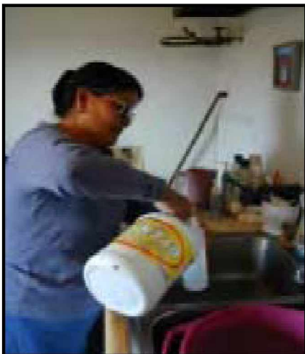
Bleach and water solution

Do not sweep or vacuum up mouse or rat urine, droppings, or nests. This will cause virus particles to go into the air, where they can be breathed in.