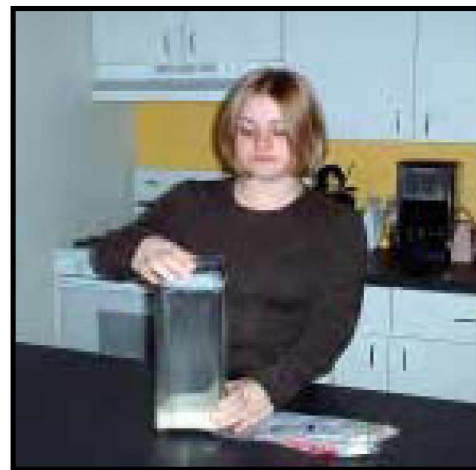
Store food in containers with lids.