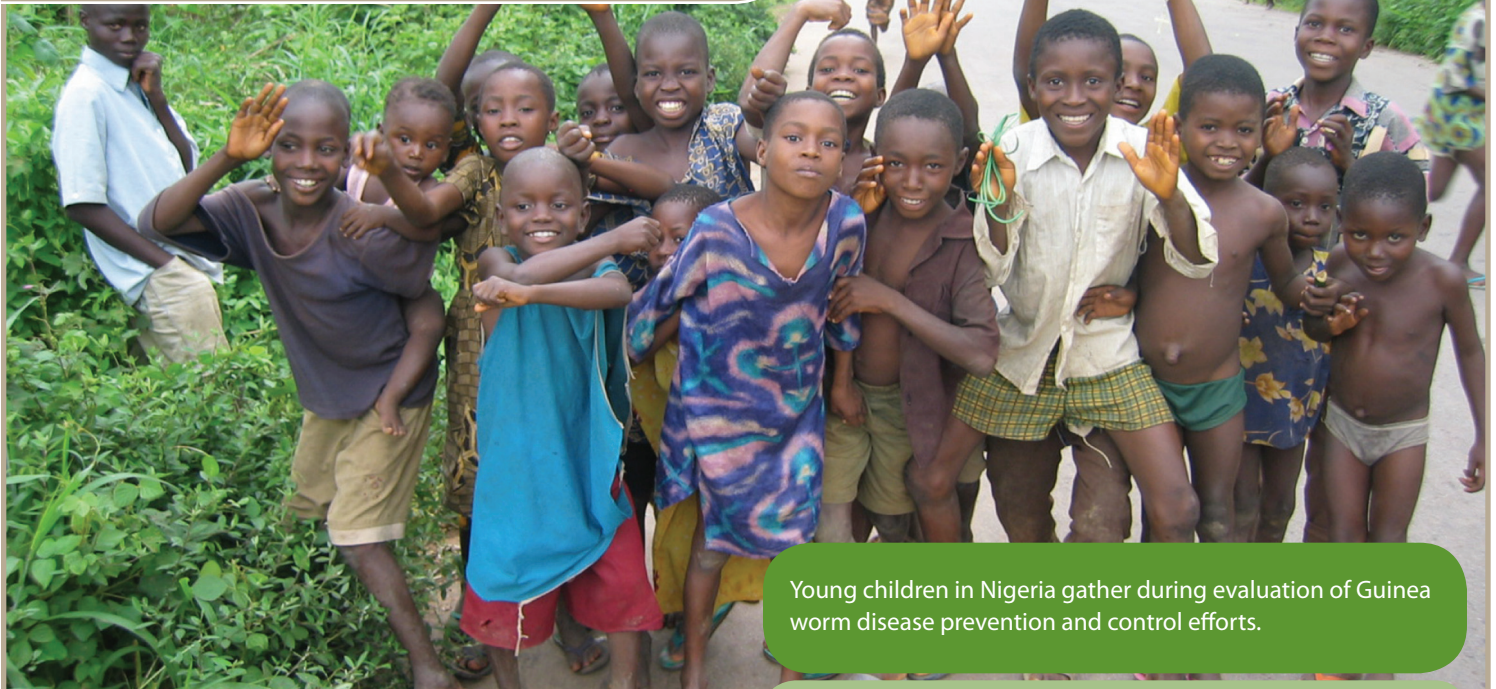
Young children in Nigeria gather during evaluation of Guinea worm disease prevention and control efforts.