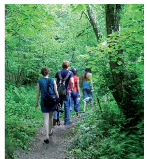
https://www.ecdc.europa.eu/en/tick-borneencephalitis;©ECDC/Photo by Guy Hendrickx