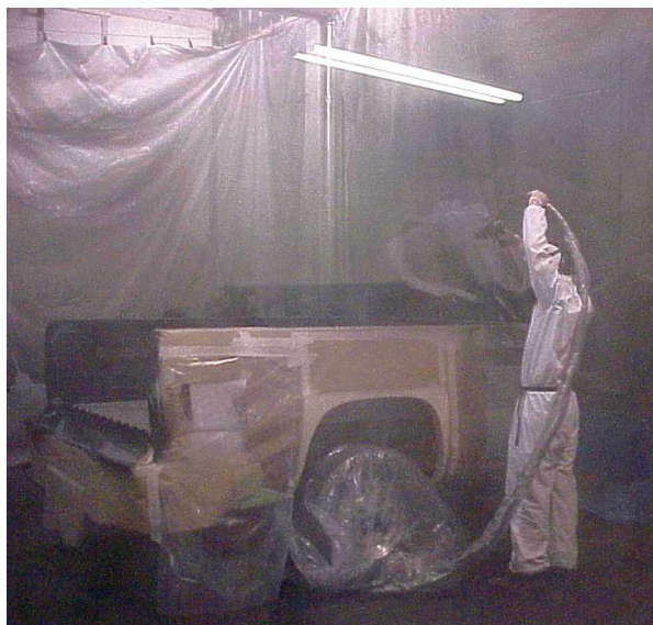
Figure 2. Spraying texturizing coat with protective equipment.

generally mixed in small quantities (quarts or gallons) at room temperature with a high-speed drill. Afterwards, the mixture is poured into a hopper gun and applied at 30–60 pounds per square inch from inside the truck bed. The chemicals used in the cold-batch operations typically contain less MDI (less than 20%). However, the cold-batch materials contain higher amounts of flammable solvents (toluene and N-butyl acetate) which should have their own exposure prevention and ventilation requirements. Cold-batch systems are popular because of the lower startup costs [Krupinski 2005].