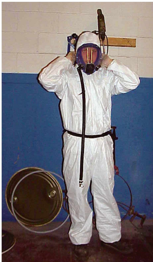
Figure 3. Worker wearing protective clothing and equipment.

When spraying MDI-based products or during entry immediately after spraying, wear