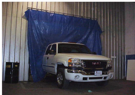
Truck in bed liner spray enclosure.

For additional information, see NIOSH Alert: Preventing Asthma and Death from MDI Exposure During Spray-on Truck Bed Liner and Related Applications [DHHS (NIOSH) Publication No. 2006-149]. Single copies of the Alert are available free from the following: