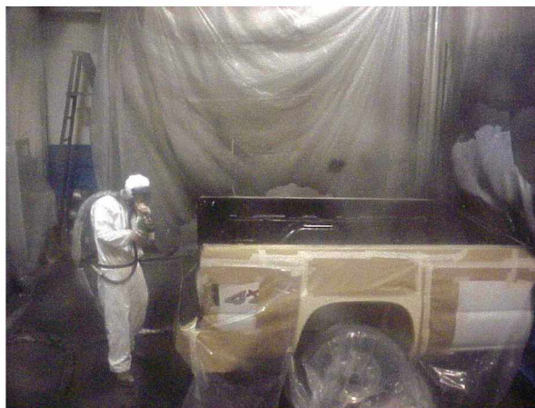
Figure 1. Spraying base coat with protective equipment.

NIOSH identified two spray-on processes commonly found in the industry [Heitbrink and Almaguer 2003]: one process applies truck bed liners at room temperature and