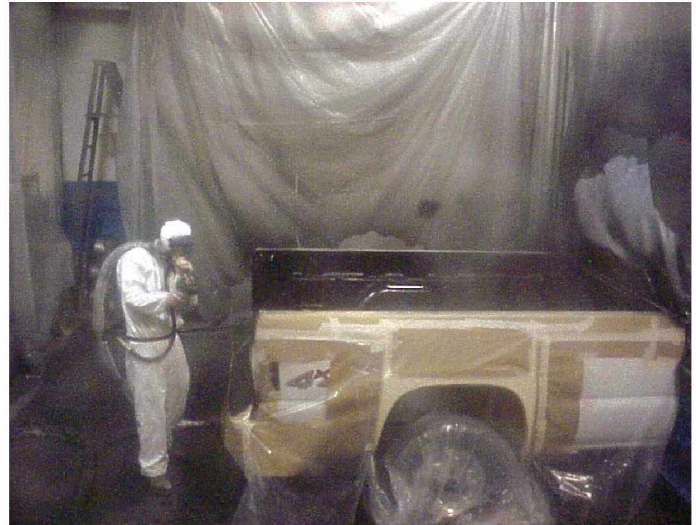
Spraying base coat with protective equipment.

For additional information, see NIOSH Alert: Preventing Asthma and Death from MDI Exposure During Spray-on Truck Bed Liner and Related Applications [DHHS (NIOSH) Publication No. 2006-149]. Single copies of the Alert are available free from the following: