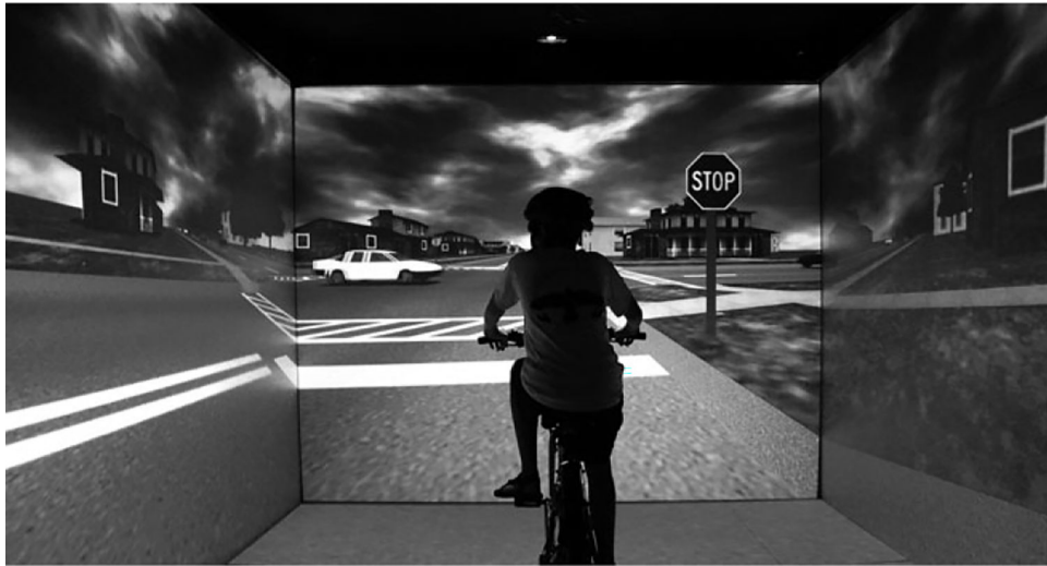
Figure 1. Photograph of a child riding the bicycling simulator. Note that visual angles are correct from the rider's viewpoint