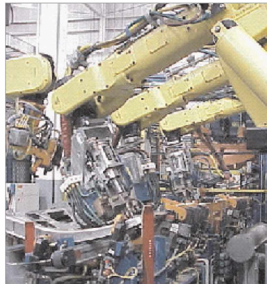
Figure 5. Robotic welders in a modern automotive assembly. Note the absence of sparks and intense UV radiation. Manufacturing engineers responsible for the robotic system operate in front of a control panel that is not in view.

Chemical manufacturing processes in the United States, Italy, and China, for example, range from manual reactor vessel charging, mixing, packaging, and maintenance to processes that are enclosed and automatic. The same process under these different conditions has different implications for worker safety and health. If a worker was exposed, the physiologic route of entry cannot always be anticipated, because knowledge of the physical state of the substances at different stages in the process is lacking.