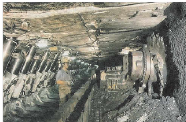
Figure 1. Improved productivity is realized with improvements in safety and health in longwall mining.