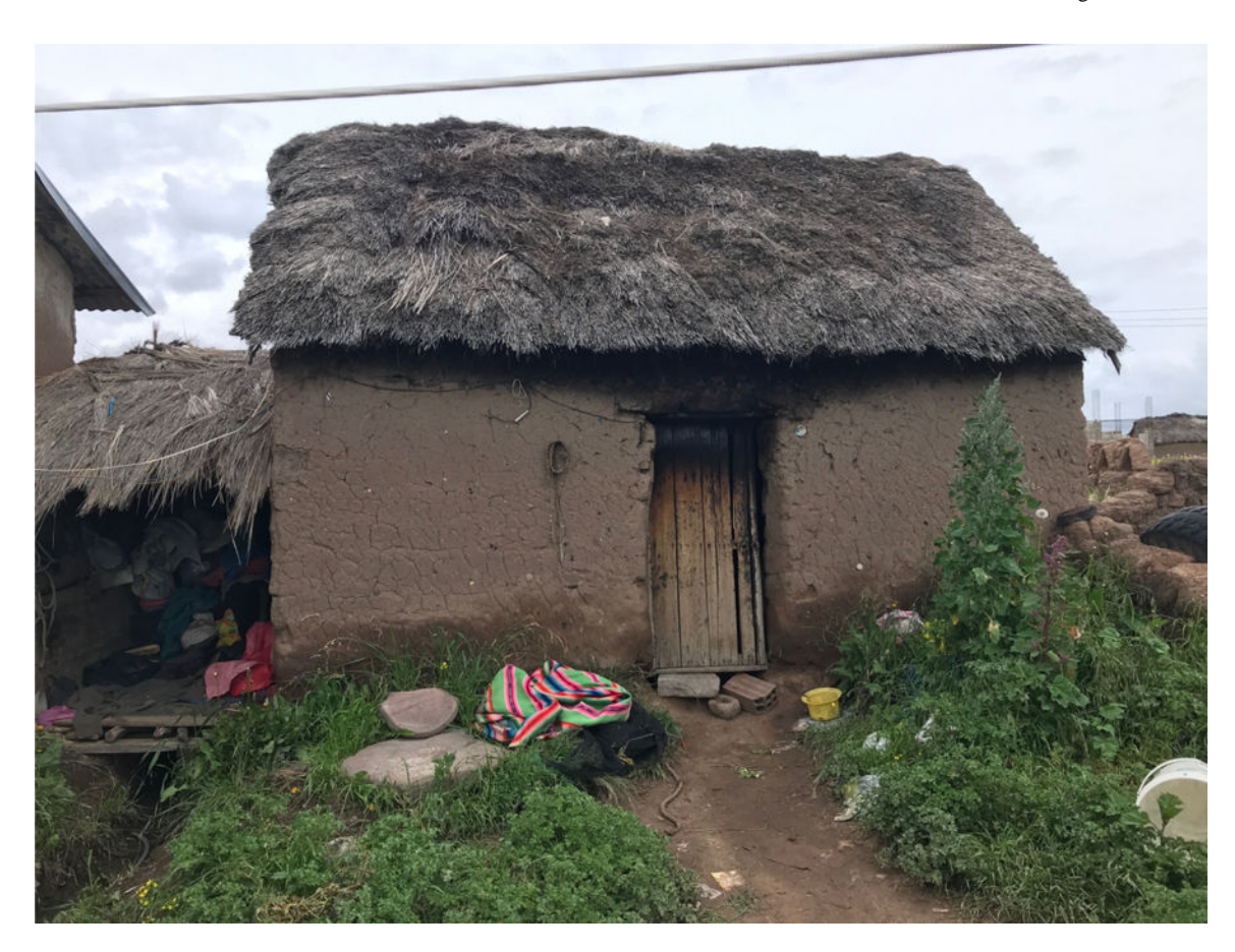
Figure 2. Adobe kitchen structure with thatch roof common in Puno. Some households have aluminum roofs.