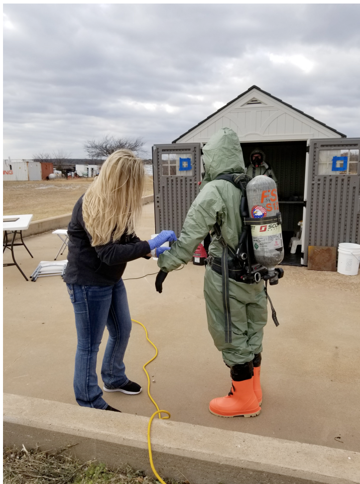
Figure S5. Collection of methamphetamine surface contamination from the researcher's PPE.