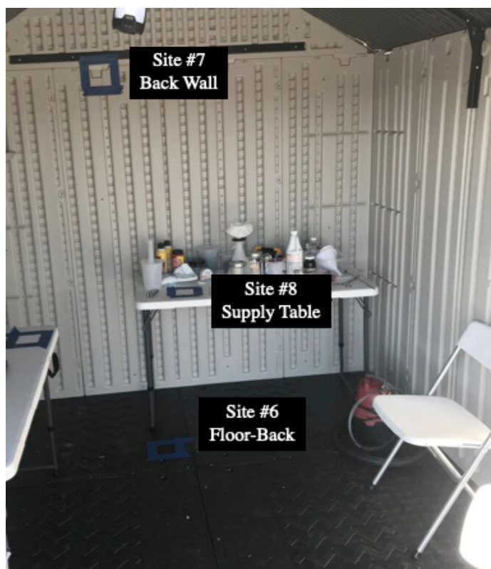
Figure S2. Methamphetamine surface contamination collection sites 6-8.