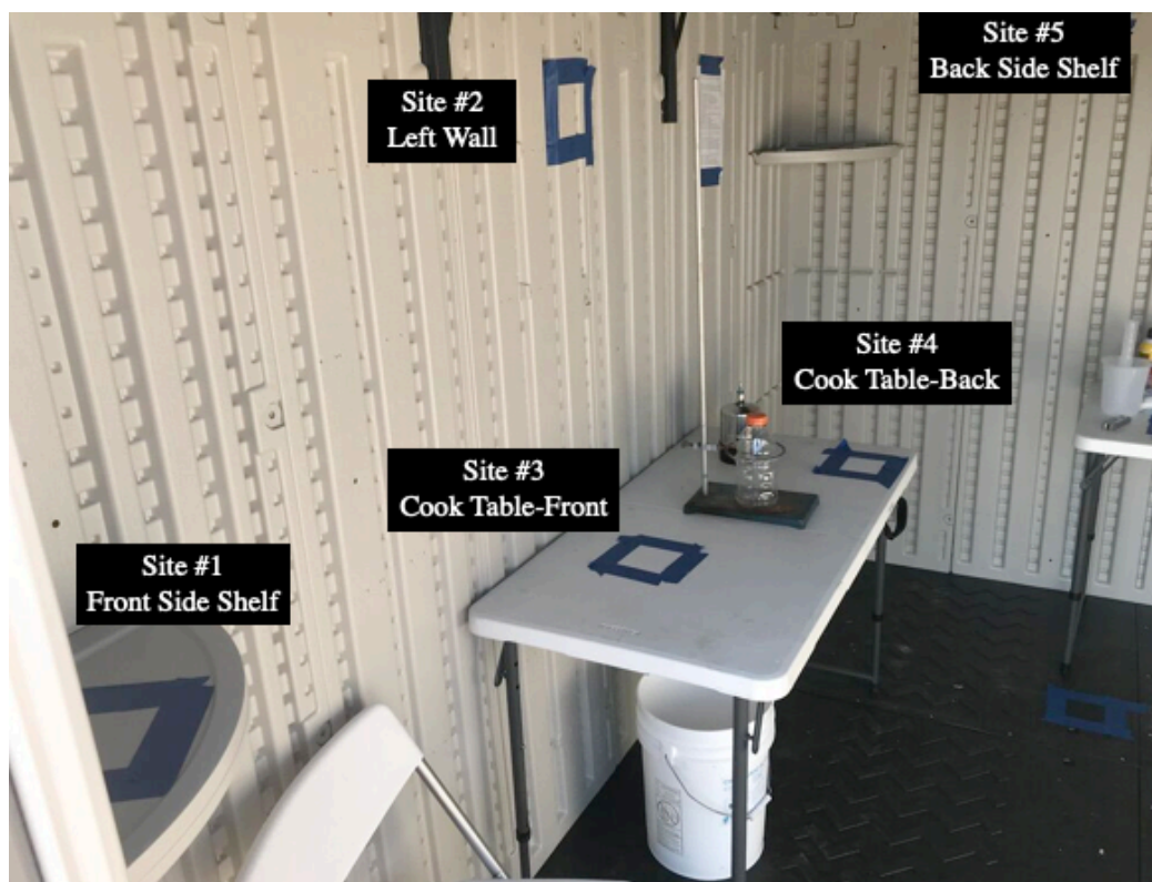
Figure S1. Methamphetamine surface contamination collection sites 1-5.