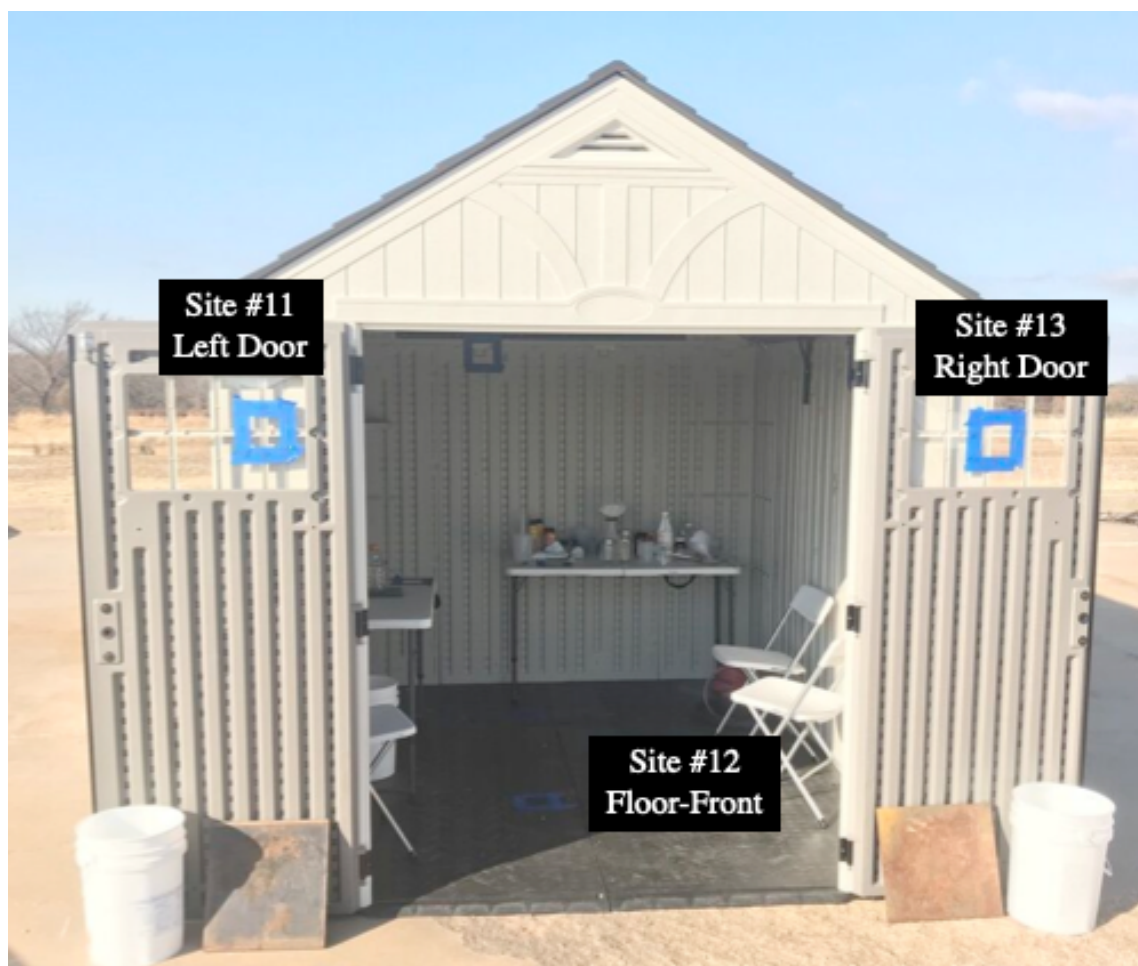
Figure S4. Methamphetamine surface contamination collection sites 11-13.